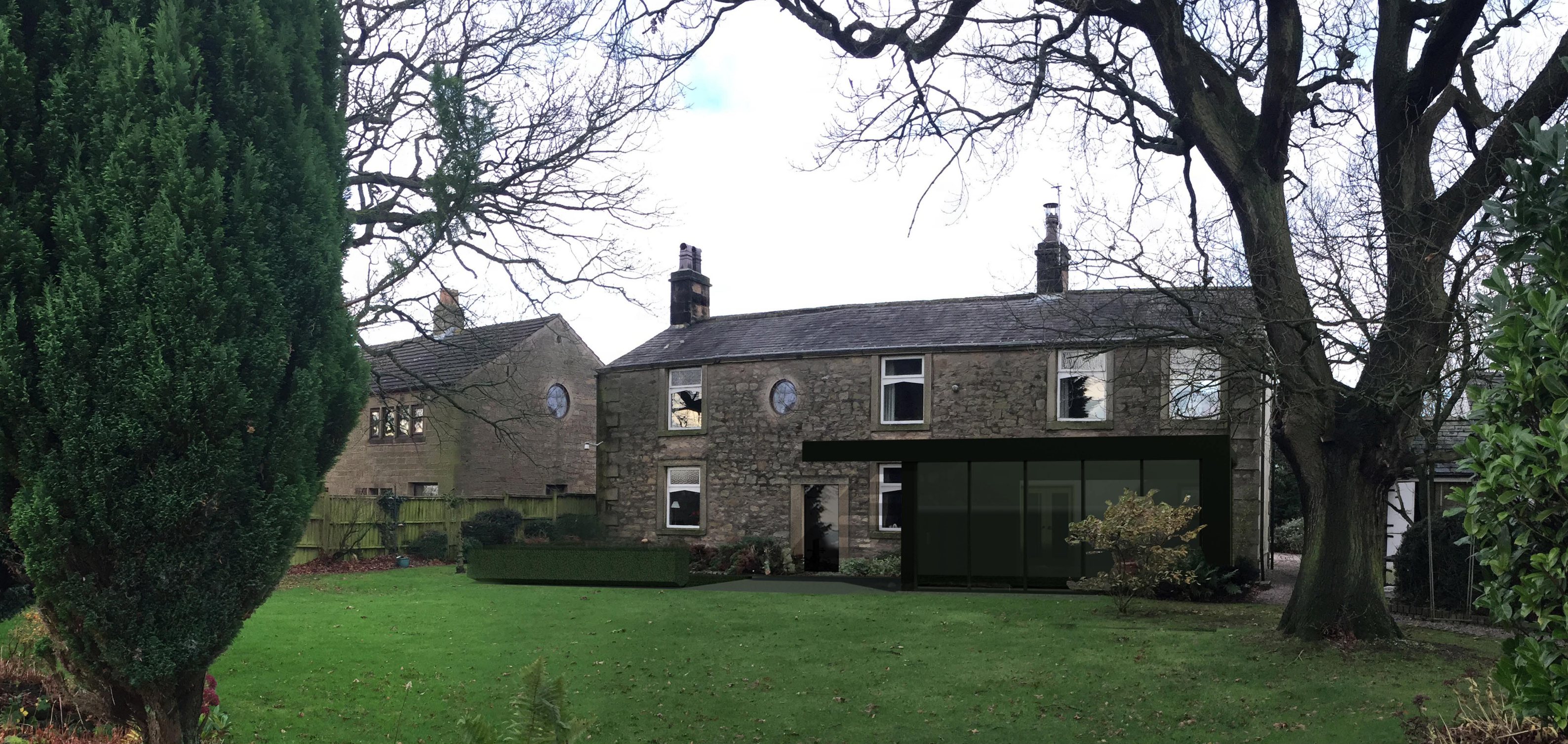
Above: Proposed Montage #2 Far Right: Existing Photo #2 Right: Proposed Aerial of Orangery (Excluding existing facade detail)