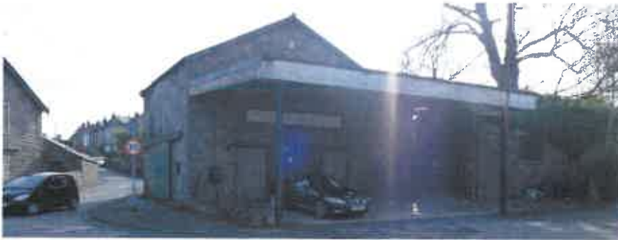
North west elevation to Sawley road

The building has been disused since 2003 it was originally a petrol station and more recently it has been used as tyre storage and car sales. The building dates from the 1800's. It appears to have been constructed for industrial or commercial use.