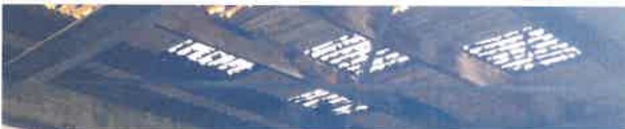
Underside of canopy roof