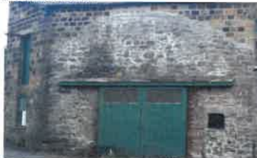
Random and coursed stone on N.W elevation