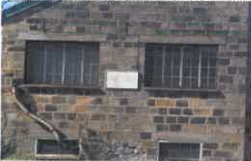
Coursed sawn stone N.E elevation

The building is a combination of coursed dressed stone and random rubble stone.