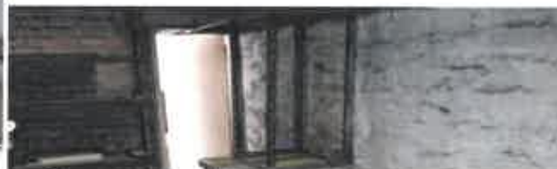
Garage interior walls