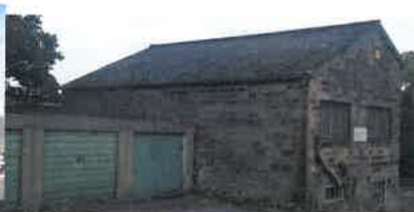
South east elevation