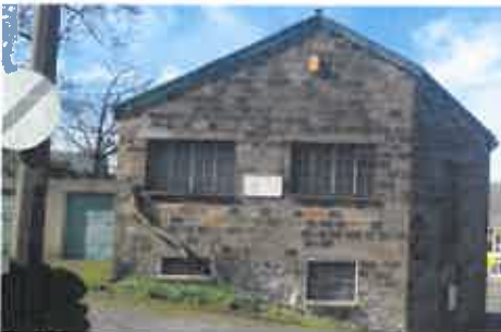
North east elevation