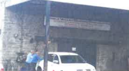
Random stone S.W elevation