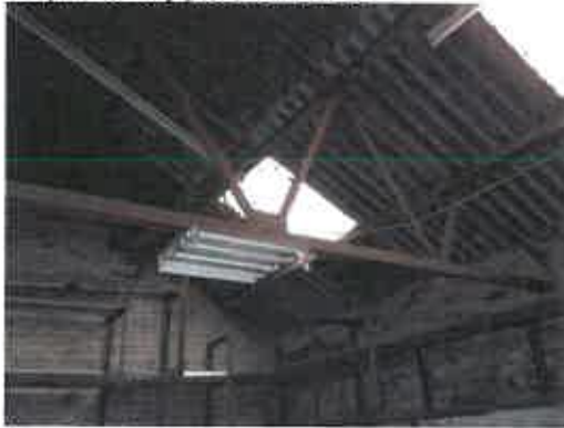
Internal roof space

The roof sheeting was supported by timber purlins and steel trusses, there is no enclosed roof void. The space is un insulated and cold it provides a sub optimal level of roosting and foraging potential. The open canopy does not provide any potential habitat.