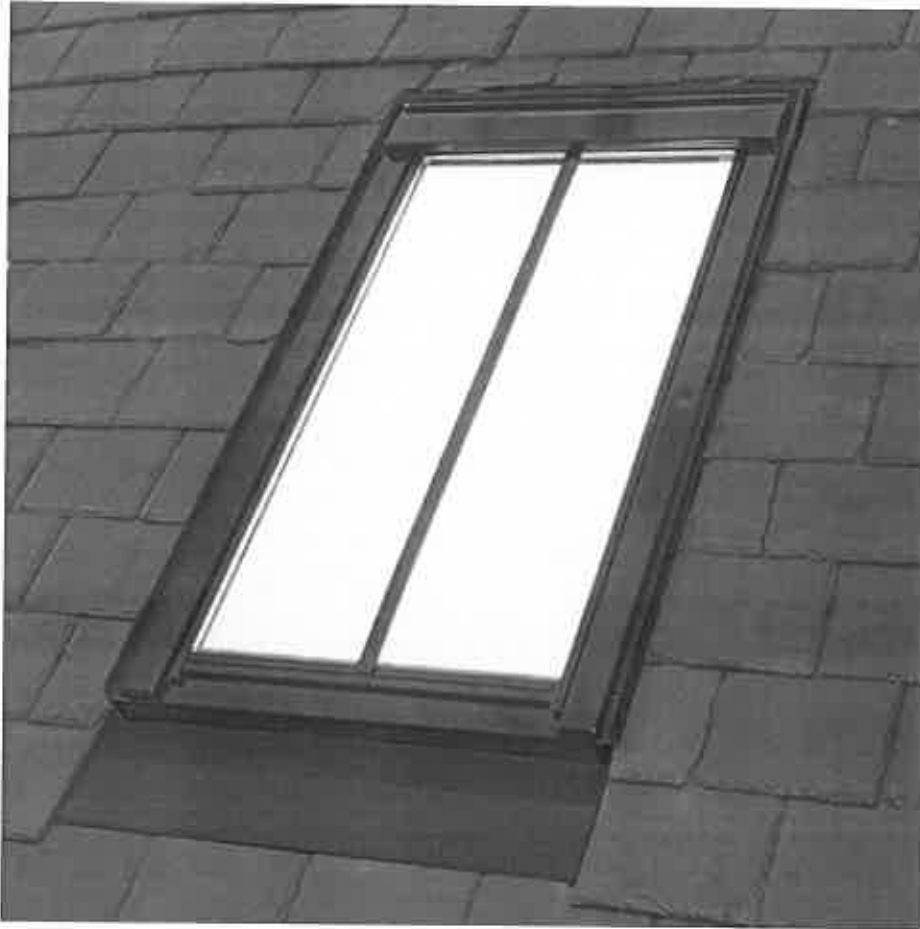
conservation type rooflight window - condition 12