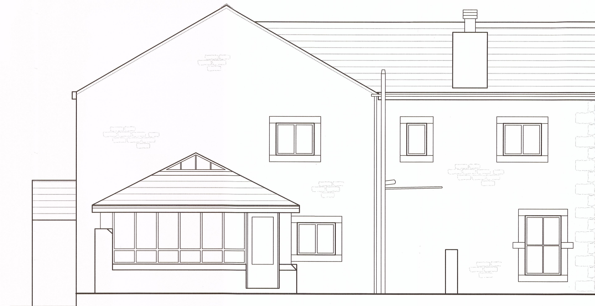
East Elevation 1:50 Scale