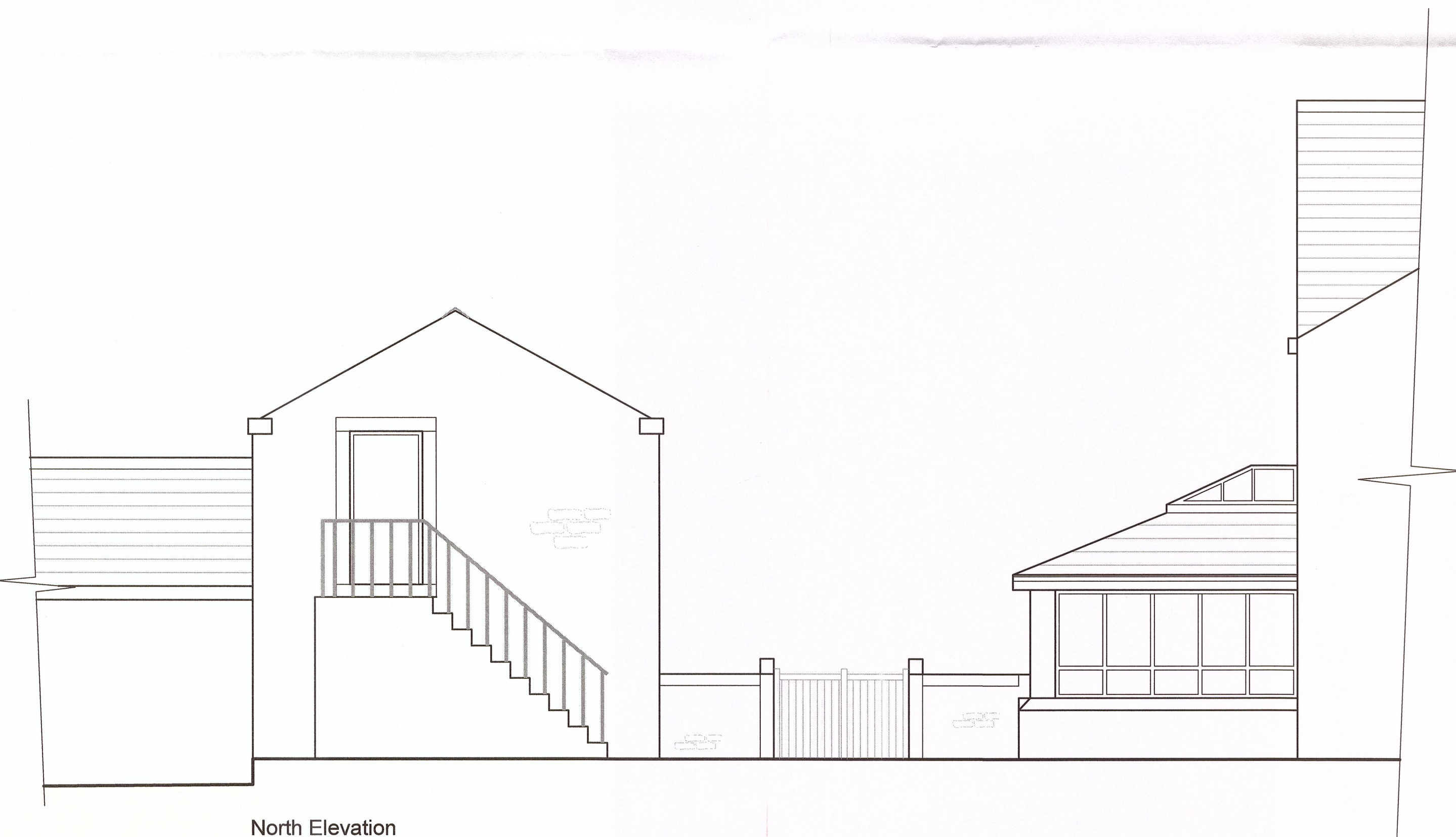
North Elevation 1:50 Scale