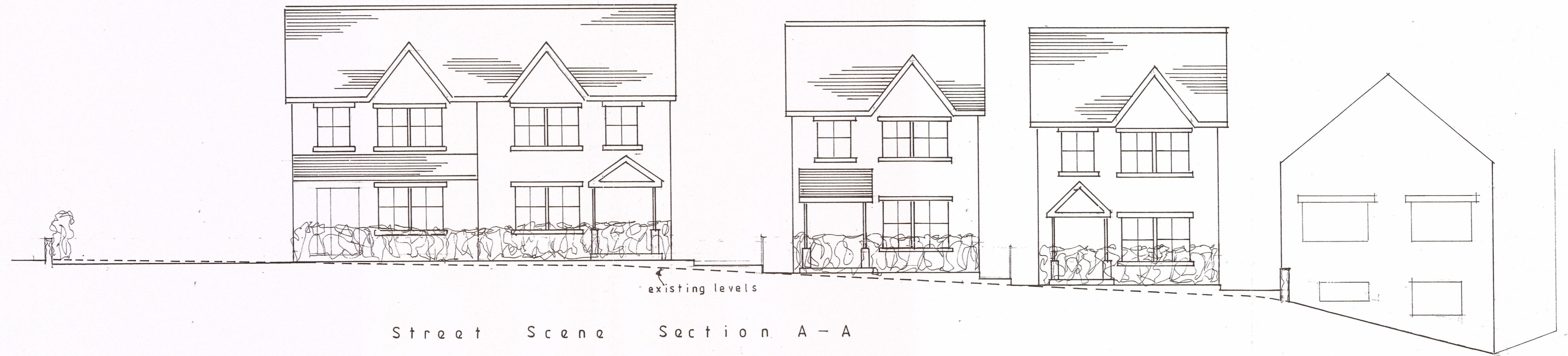
Street Scene Section A - A