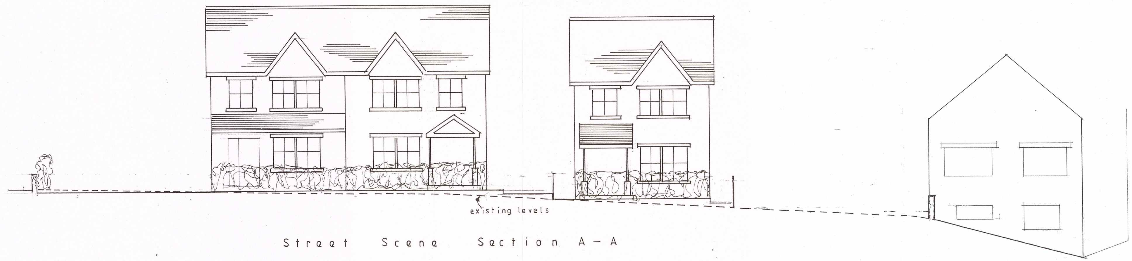
Street Scene Section A - A