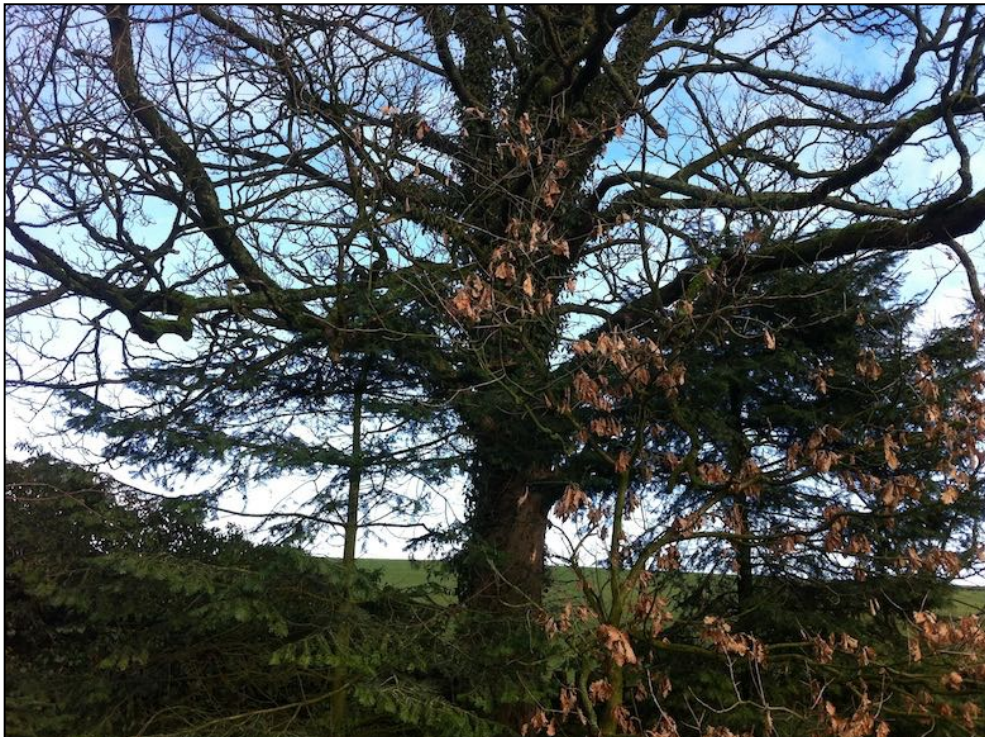
Figure 7 Mature sycamore to the north of the site, at least marginally suitable for bat roosting