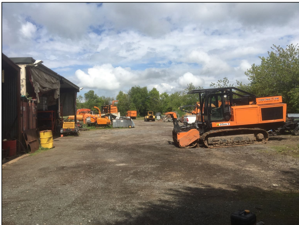
Figure 4 The existing machinery yard, Section C, two of the existing buildings visible to the left