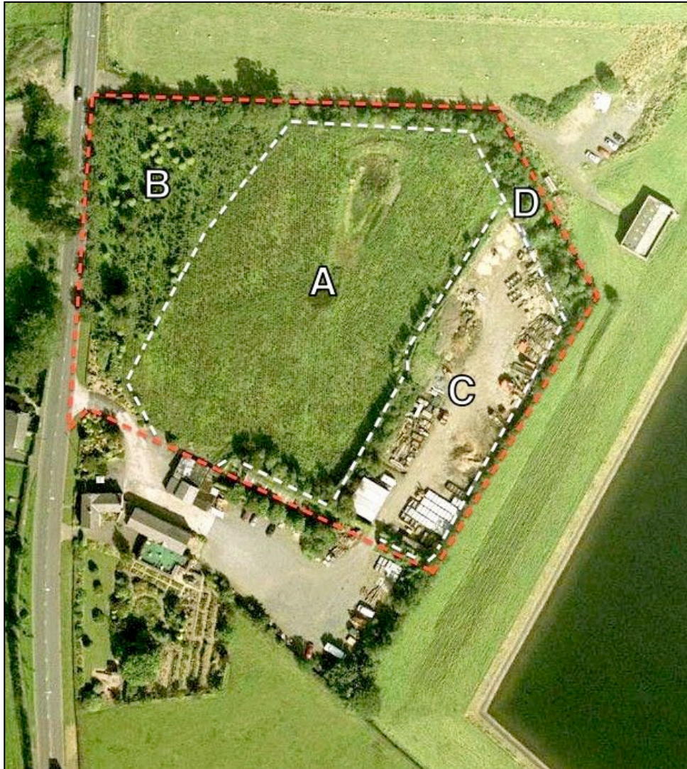
Figure 2. Existing site layout (within dashed red line boundary)