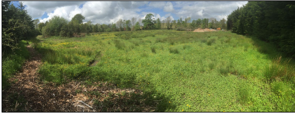
Figure 3 The main part of the site (Section A) as viewed from the southwest corner

are primarily native species, the dominant species being hawthorn. Further along the western boundary, the boundary is formed by a mature hawthorn hedge, which runs the full length of this section as well as partially along the southern boundary until it meets the entrance to the compound (section C). The hedge is mostly dense and intact, to a height of at least 6-7m in parts, but is relatively species-poor and does not qualify as an Important Hedgerow in respect of the Hedgerow Regulations 1997.