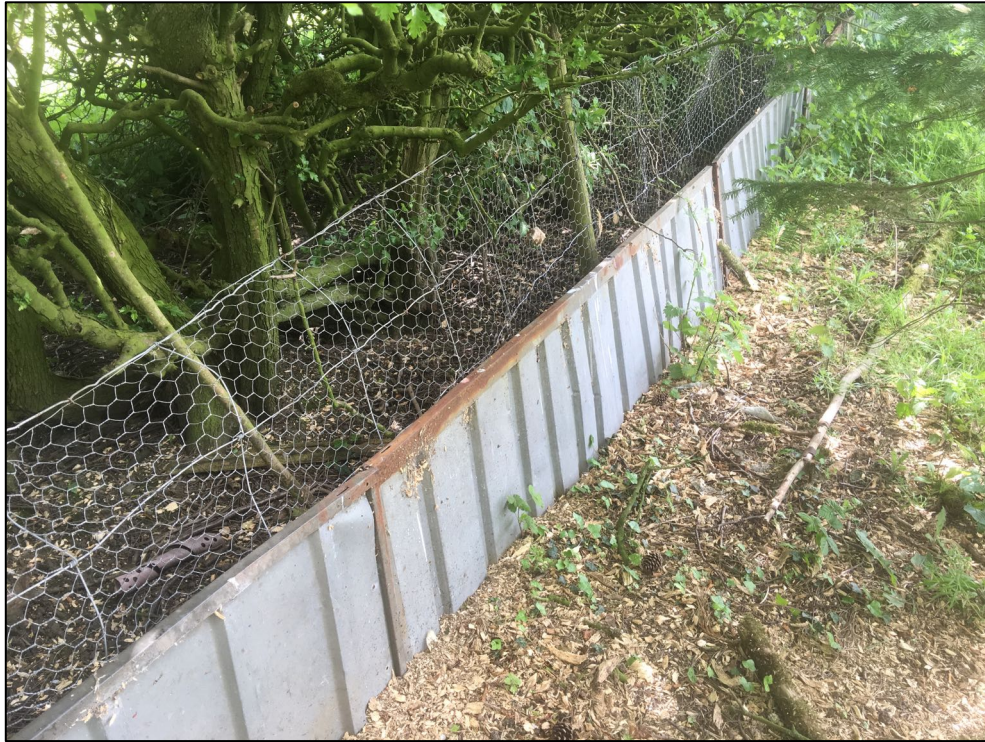
Figure 8 The existing amphibian-proof fence that surrounds the site