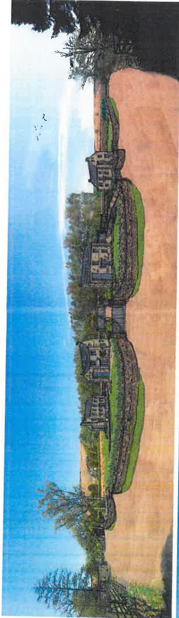
1.0 PROPOSED AND EXISTING PERSPECTIVE VIEW FROM SITE ACCESS ROAD