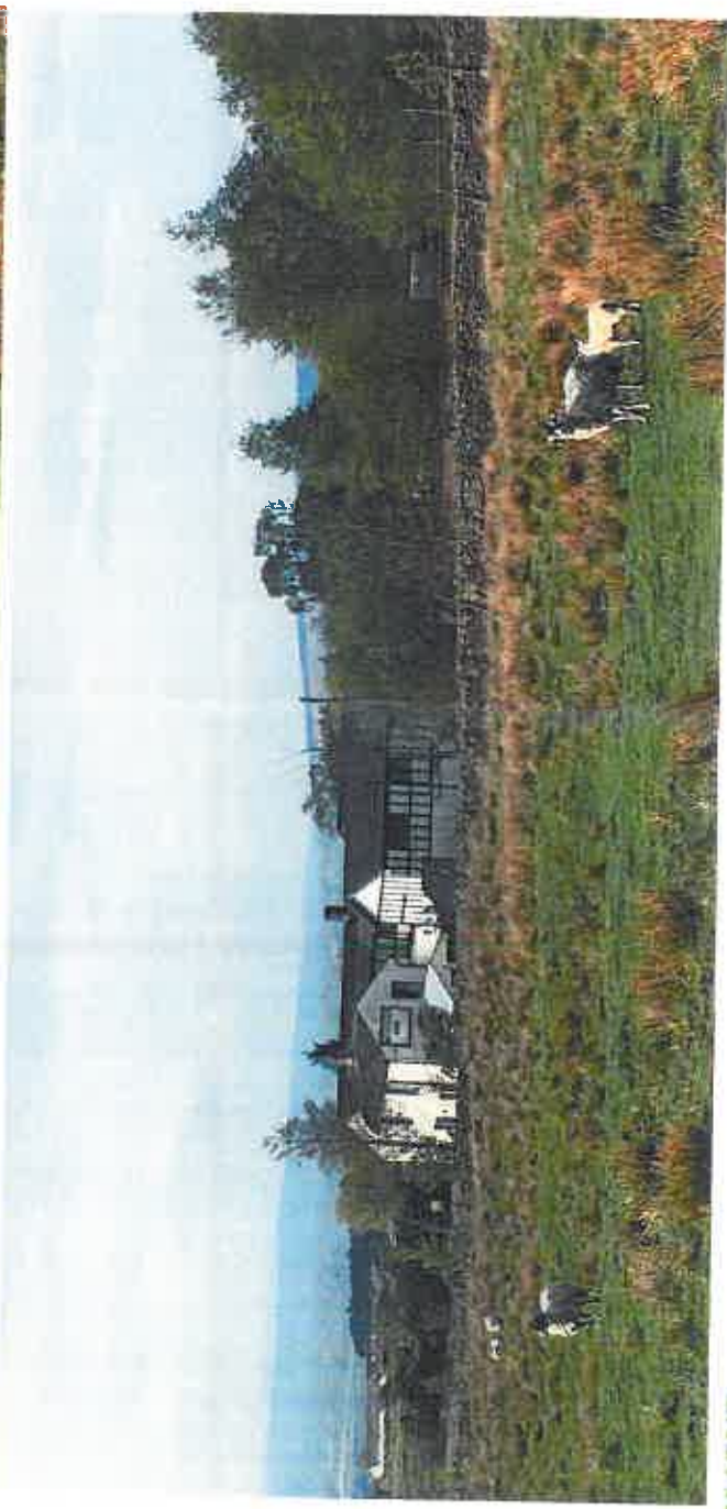
PROPOSED DEVELOPMENT MOORCOCK INN, WADDINGTON