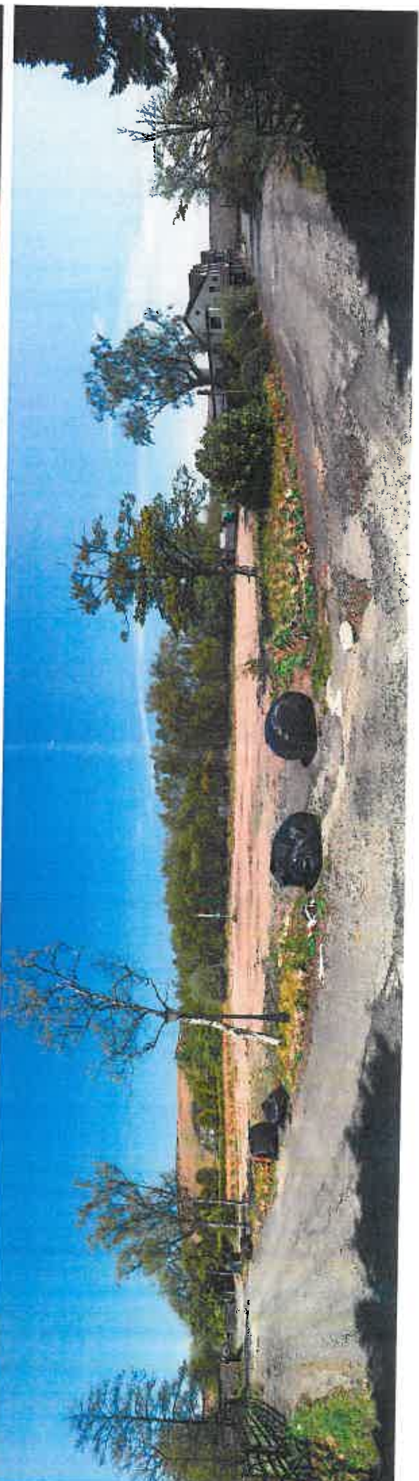
PROPOSED DEVELOPMENT MORRISCK INN, WADDINGTON