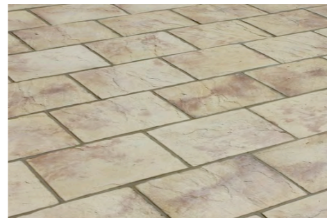
03 existing paving retained

rear patio to be paved with natural stone similar to that shown opposite area of paving to rear of the property to abut the existing garden retaining wall