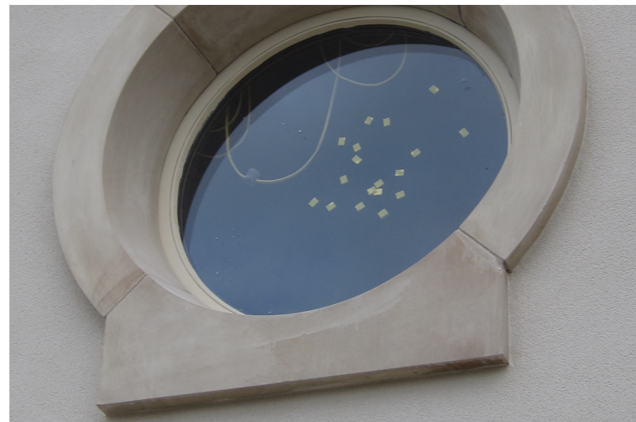
locally sourced ashlar stone surrounds

Window and door surrounds will be in locally sourced ashlar stone. For further details see drg. 1545 PL 21