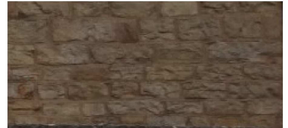
locally sourced natural stone