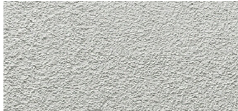
lightly textured render with white finish

Walls will be slightly textured sand / cement render with a white finish mixed with areas of locally sourced natural stone to match the adjacent cottages.