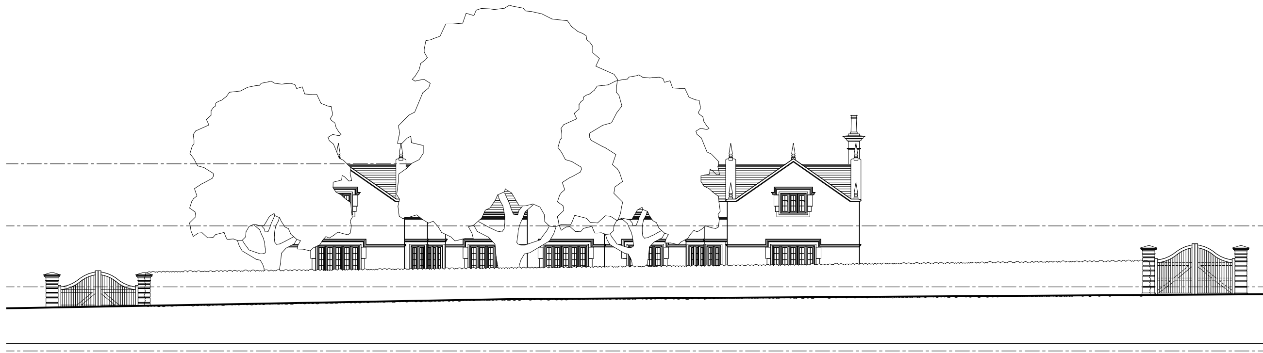
EAST ELEVATION - ACTUAL CONTEXTUAL ELEVATION THROUGH EXISTING ROAD (With foliage obscuring view)