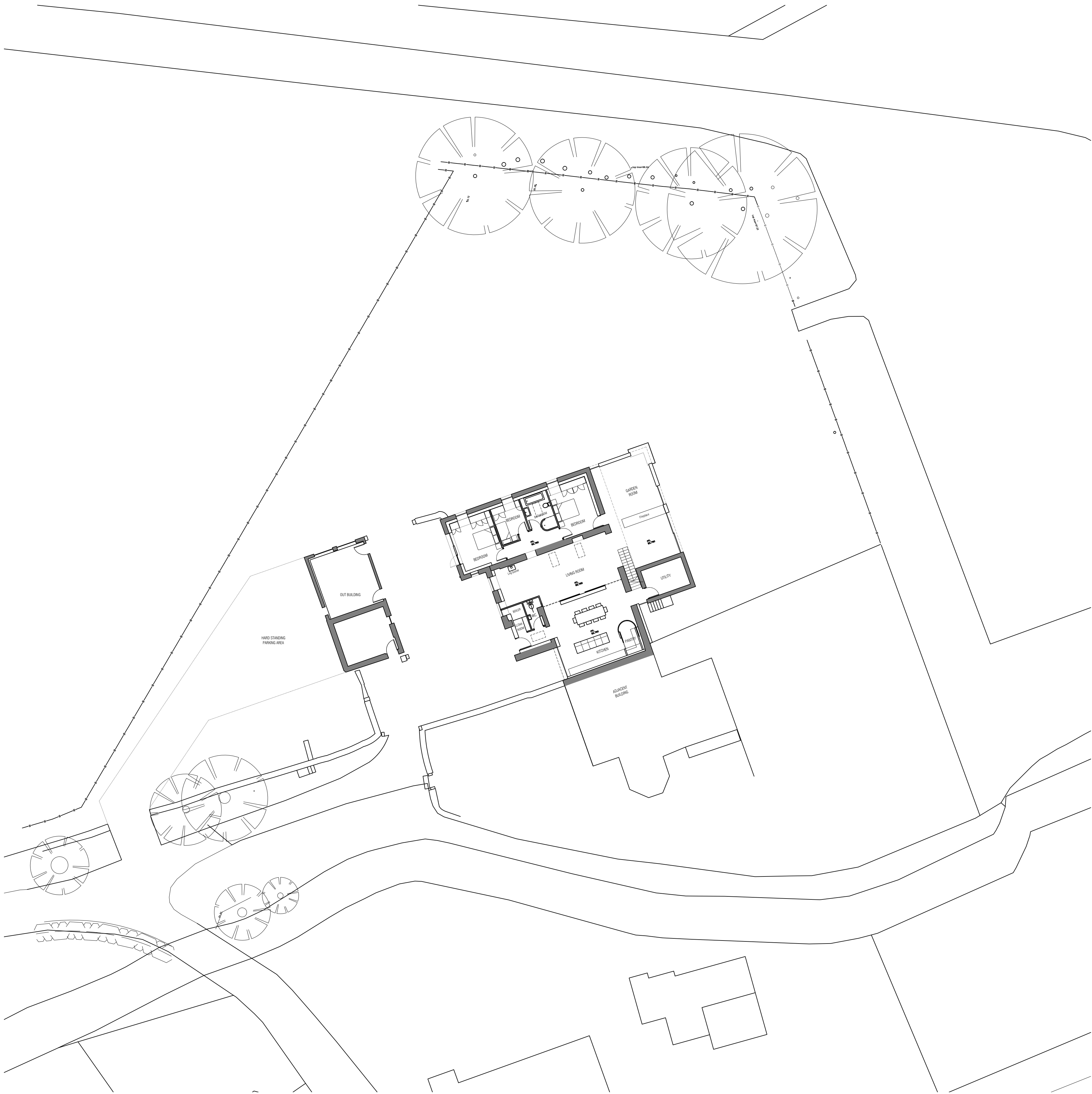
Proposed Site Plan Scale: 1:200