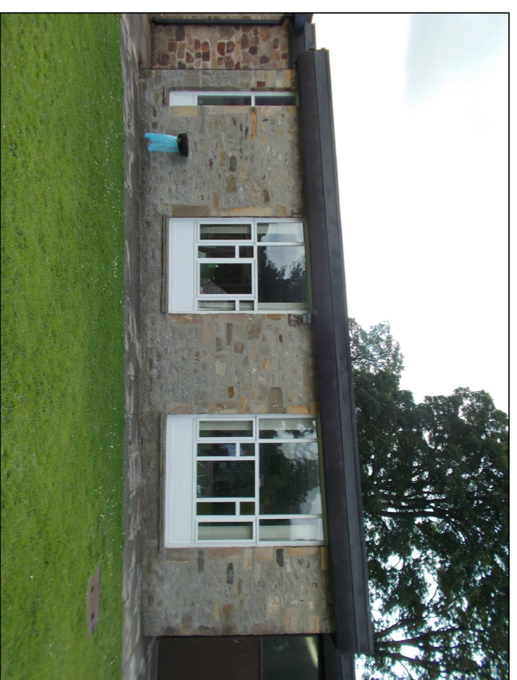
Existing Elevations at Site of Proposed Project