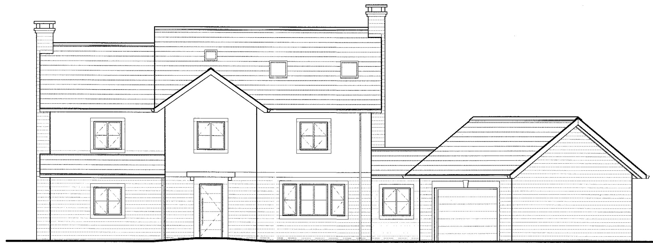
North West (Front) Elevation 1:100 Scale

This drawing is to be read in conjunction with all relevant Architect, consultant's and specialist's drawings and specifications. The Architect is to be notified of any discrepancies before proceeding. Do not scale from the drawing. All dimensions and levels are to be checked on site. This drawing is subject to copyright. All work carried out before Planning and Building Permission has been granted is at the contractor's risk. NOTE: All dimensions are to the face of blockwork /studwork (not to plaster finish).