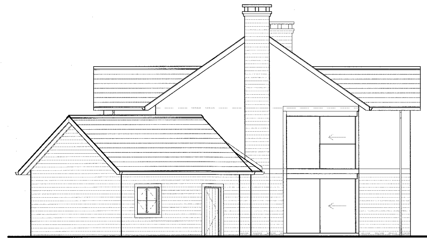
South West Elevation 1:100 Scale