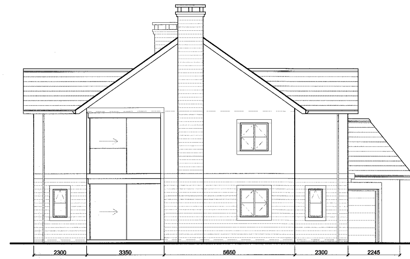
South West Elevation 1:100 Scale