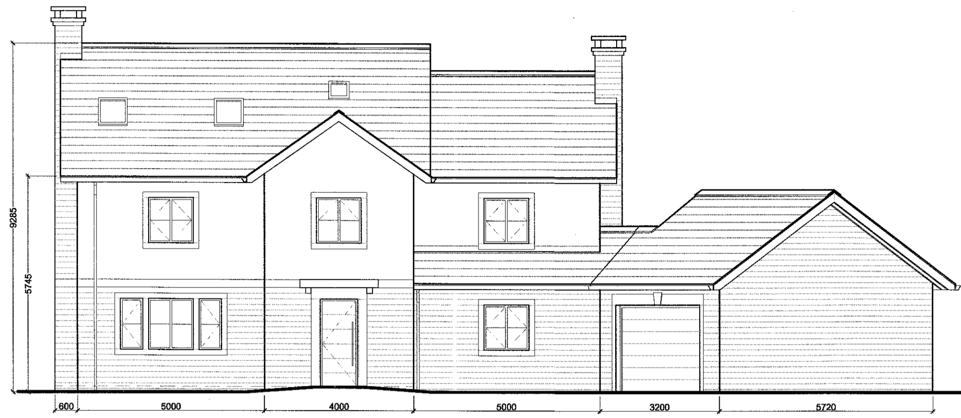
South East (Front) Elevation 1:100 Scale

This drawing is to be read in conjunction with all relevant Architect, consultant and specialist drawings and specifications. The Architect is to be notified of any discrepancies before proceeding. Do not scale from this drawing. All dimensions and levels are to be checked on site. This drawing is subject to copyright. All work carried out before Planning and Building Permission has been granted is at the contractor's risk. NOTE: All dimensions are to the face of blockwork, masonry or plaster finish.