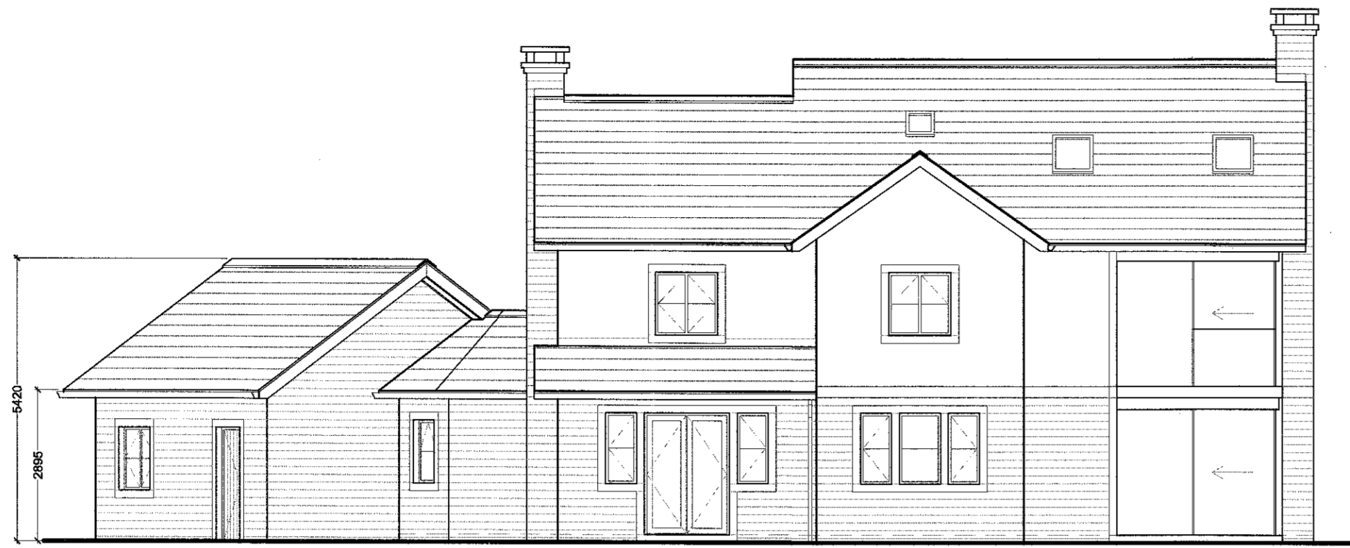
North West (Rear) Elevation 1:100 Scale

This drawing is to be read in conjunction with all relevant Architect, consultant and specialist drawings and specifications. The Architect is to be notified of any discrepancies before proceeding. Do not scale from this drawing. All dimensions and levels are to be checked on site. This drawing is subject to copyright. All work carried out before Planning and Building Permission has been granted is at the contractor's risk. NOTE: All dimensions are to the face of blockwork. (not to plaster finish)