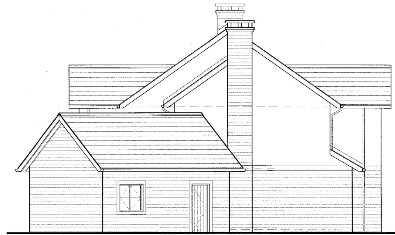
North East Elevation 1:100 Scale