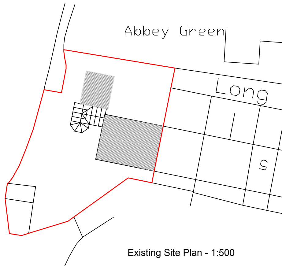
Existing Site Plan - 1:500