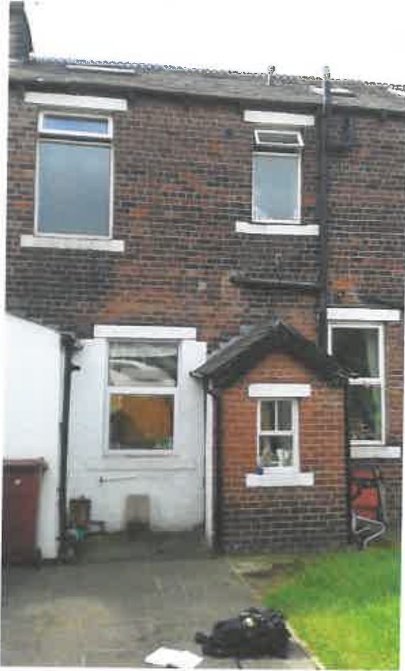
Existing rear elevation (porch)