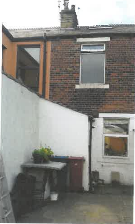
Existing rear elevation (boiler room)

The proposed extension is to be finished externally with white painted render as the existing boiler room extension is with a natural blue slate roof.