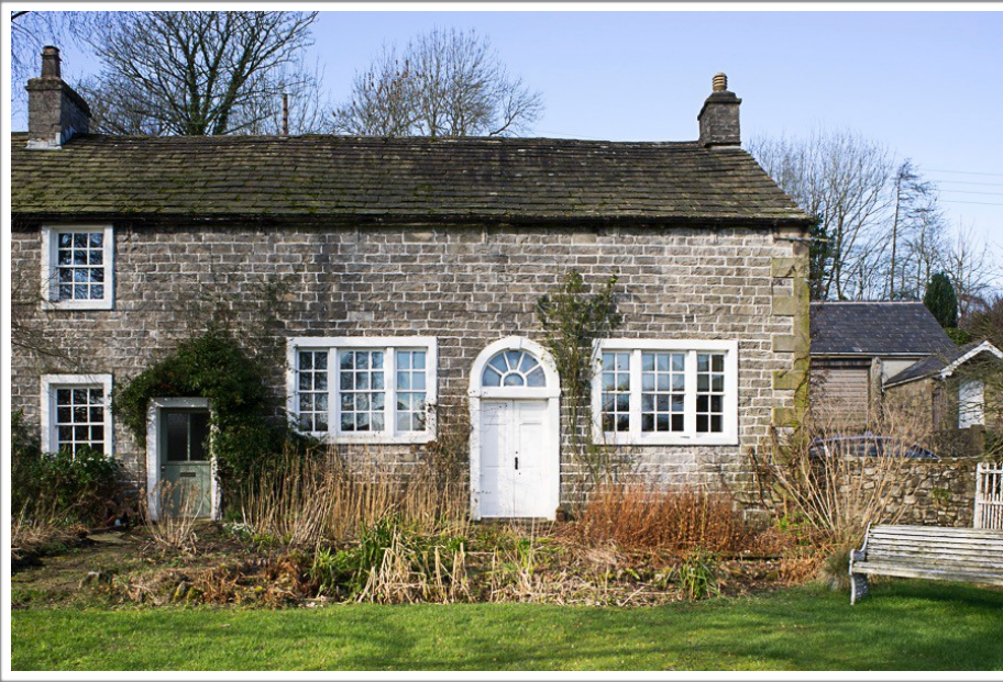
GENERAL VIEW OF SAWLEY FRIENDS MEETING HOUSE.