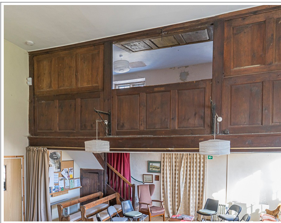
RAISED PANEL ON THE GALLERY IN THE MEETING ROOM

common arrangement in early Friends Meeting Houses to facilitate specific forms of worship and business meetings. Some recent alterations now restrict the ability of one panel to fully open and one