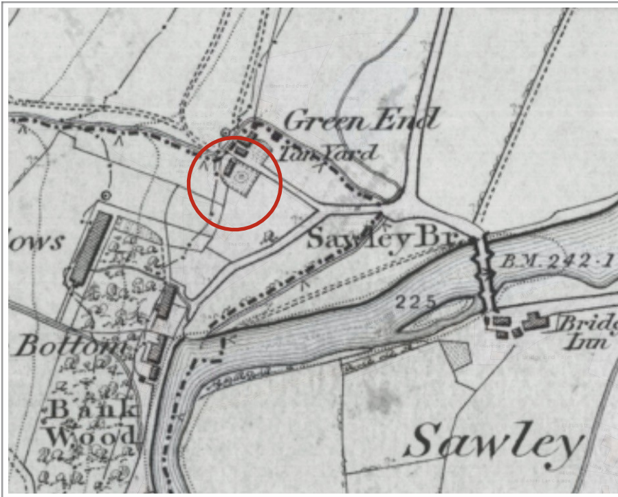
FIRST EDITION 'COUNTY SERIES' 1: 10000 OS MAP

The building lies within the Sawley Conservation Area and is marked on the plan as a Listed Building. However, it is not identified as a significant structure nor is the view of it from the main Sawley to Grindleton Road identified as an 'important view'. 4