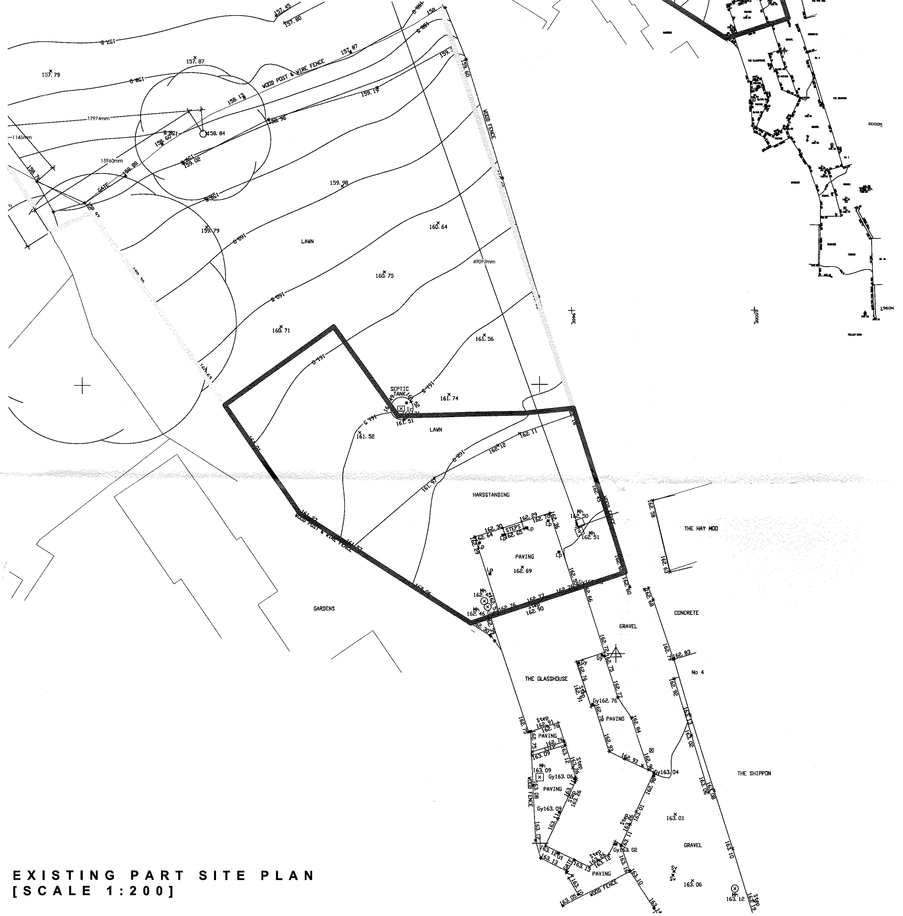
EXISTING PART SITE PLAN [SCALE 1:200]

A PRG Drawing update. 26.08.2014 no. by revision date