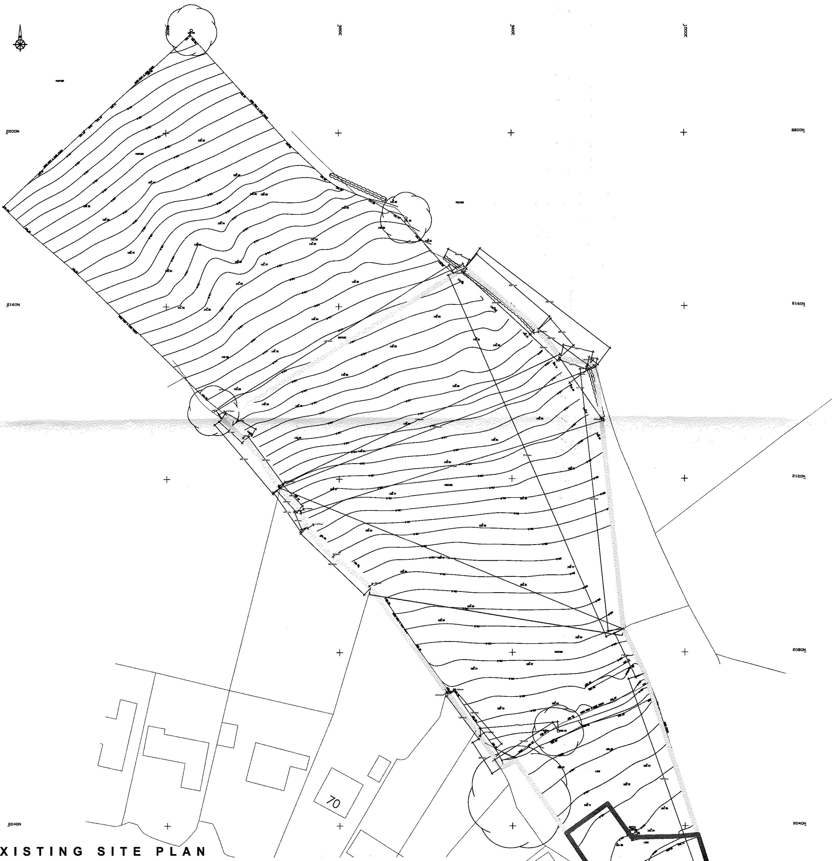
EXISTING SITE PLAN [SCALE 1:500]