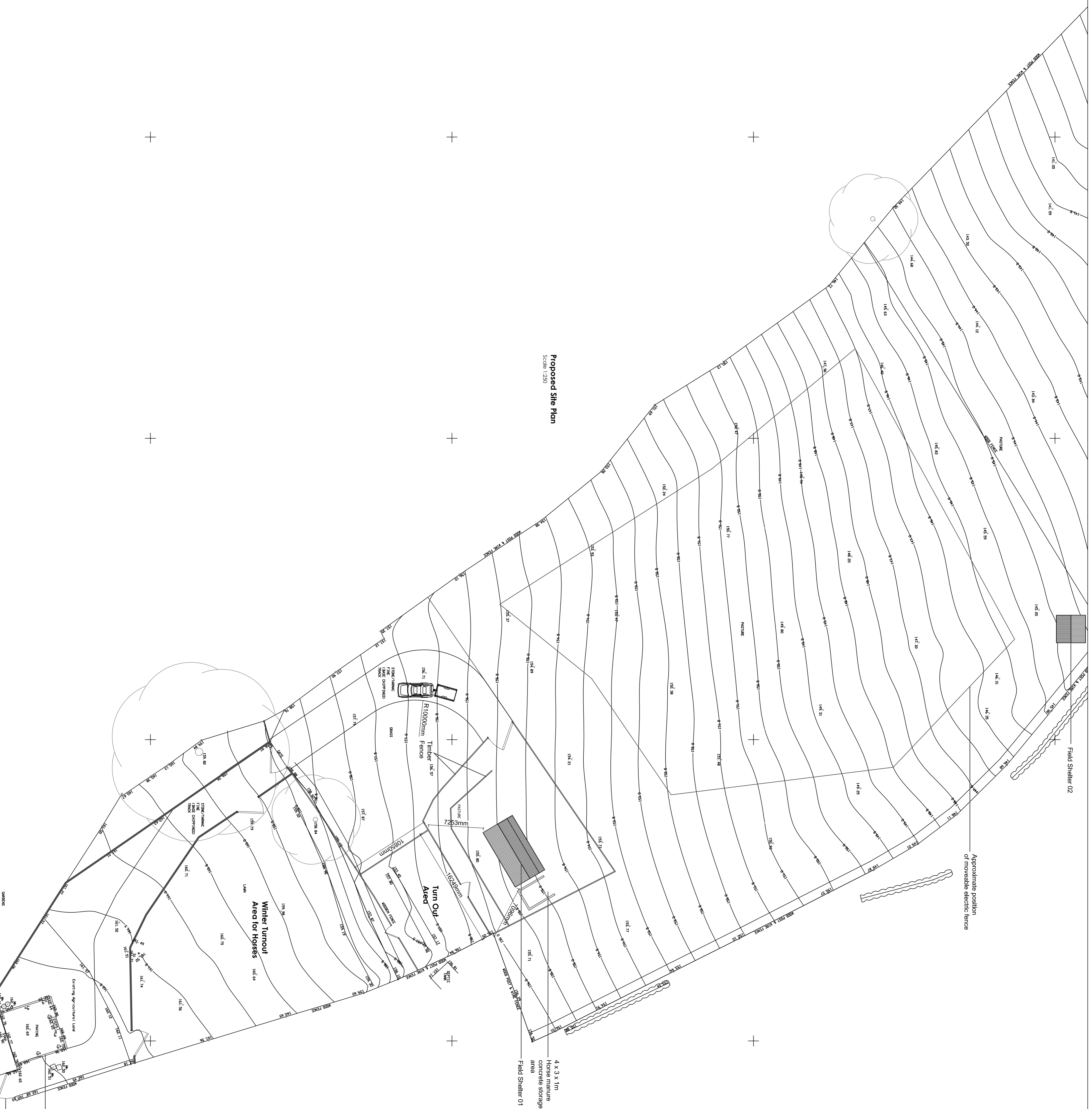
Proposed Site Plan Scale 1:250