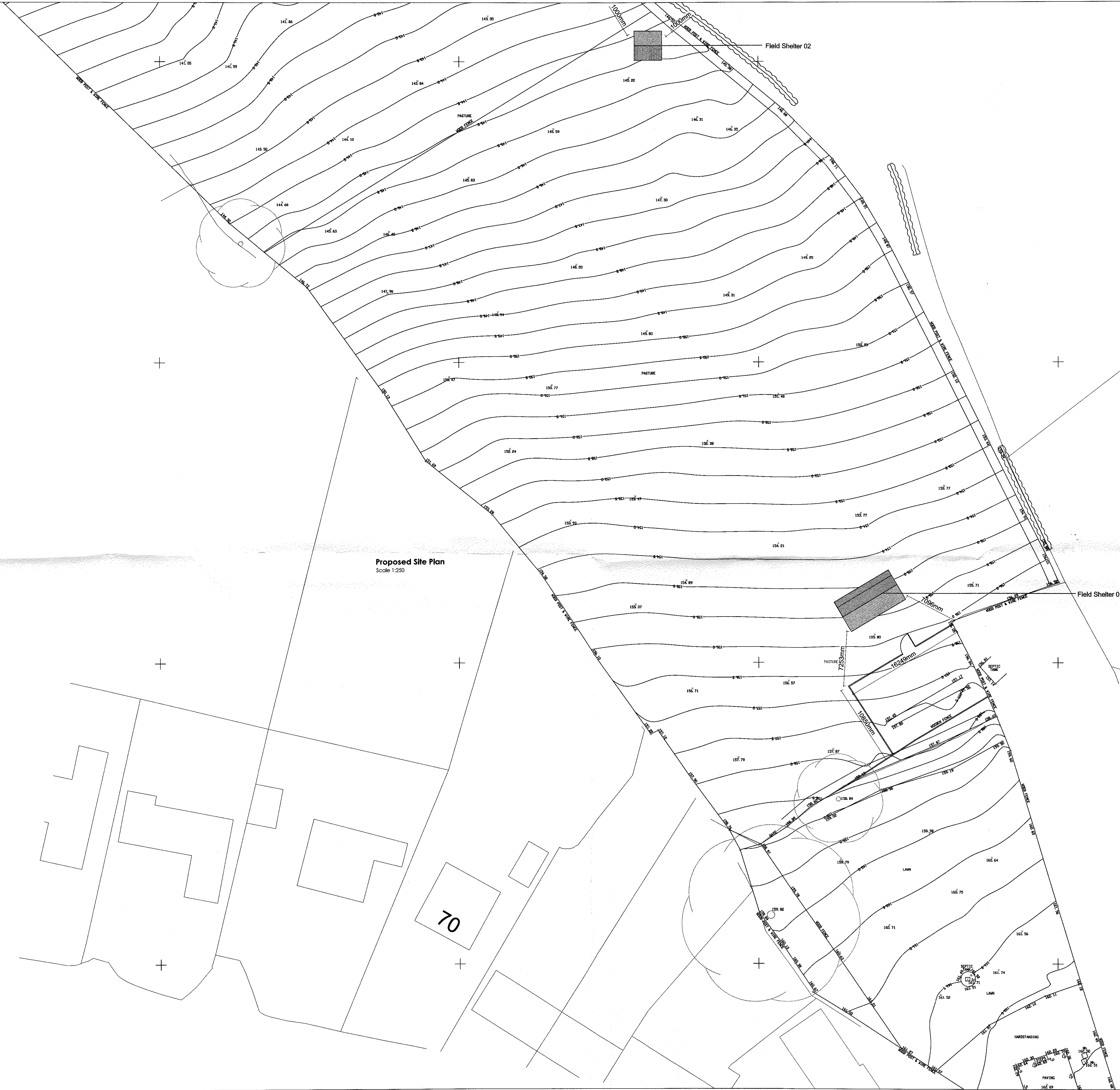
Proposed Site Plan Scale 1:250