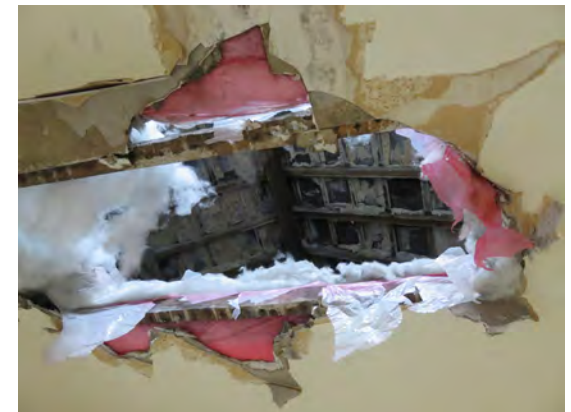
Number 17 - underside of roof through damaged ceiling lining.