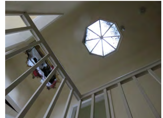
Number 17 - second floor landing ceiling lantern - existing rooflight above.