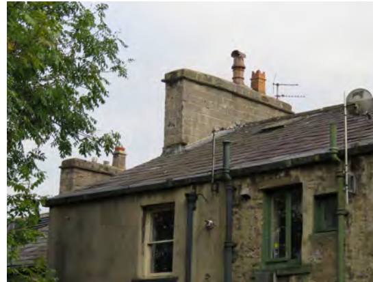
Number 17 - existing rooflight.

Re-roofing of numbers 15 and 17 York Street is urgently needed and is predominantly a like for like repair. The introduction of a breather membrane will improve the performance of the roof and have no impact on the significance of the building. The replacement and reintroduction of rooflights to the rear elevation is sympathetic to the heritage of the building and will enable the future restoration of the ceiling lantern to the interior of number 15. These are discretely located out of sight and will enhance the heritage asset.