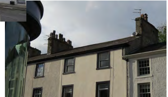
Front Elevation - roof.