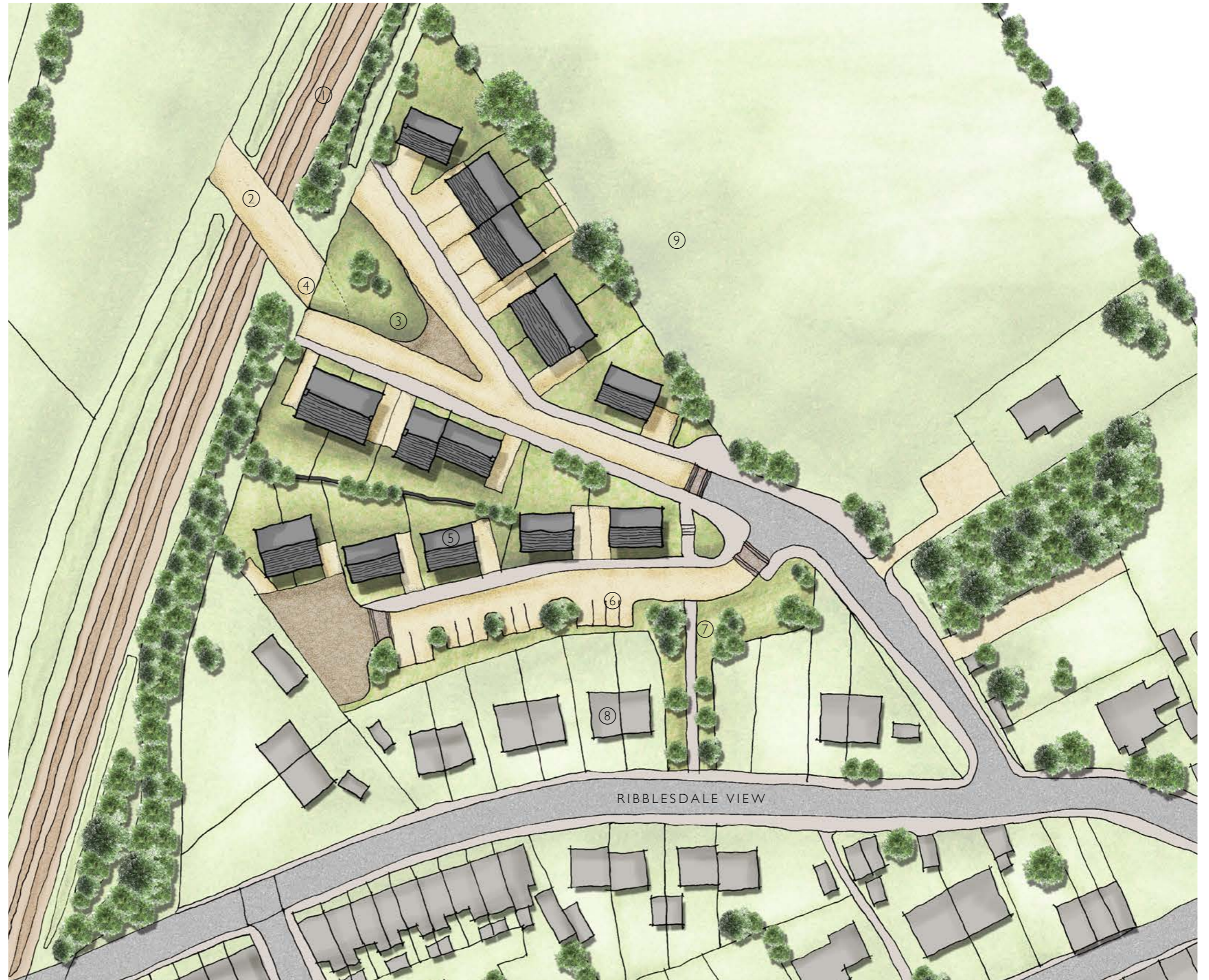
Proposed Site Plan 1:750@A3