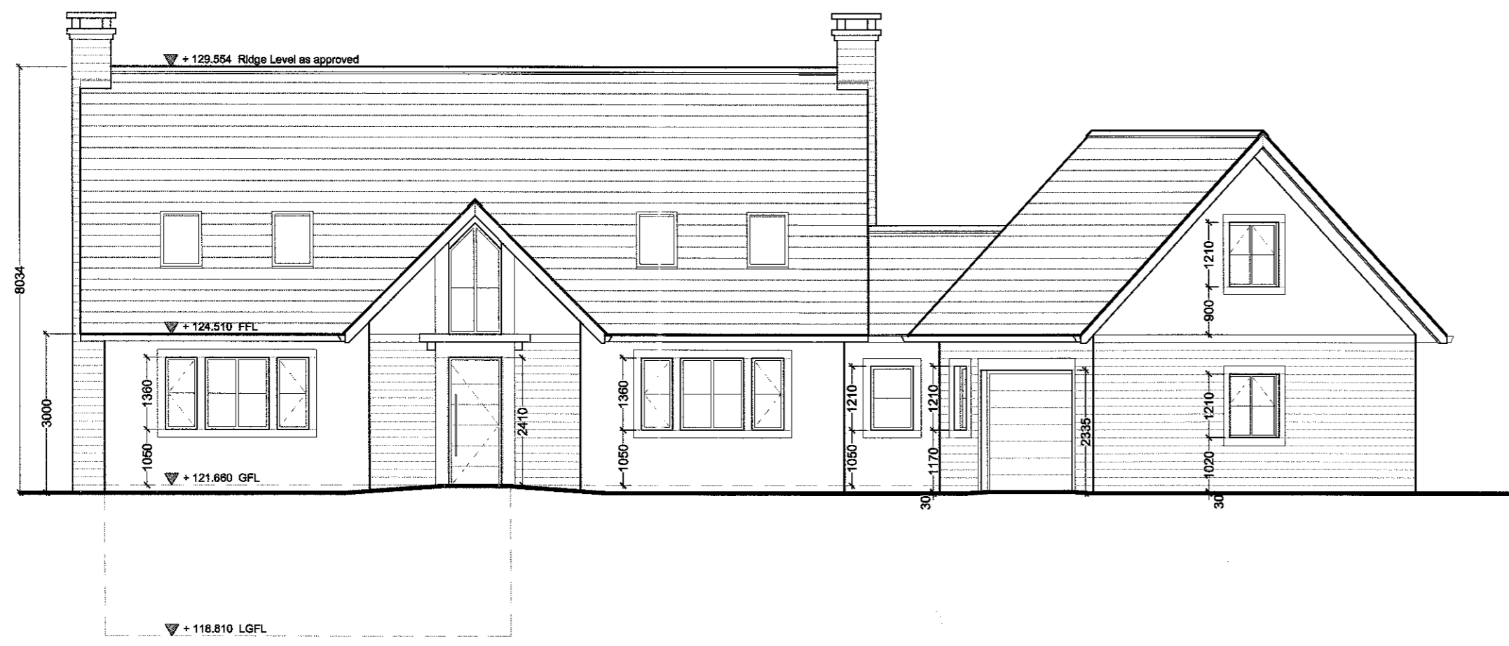
North (Front) Elevation 1:100 Scale

This drawing is to be read in conjunction with all relevant Architect, consultants' and specialist drawings and specifications. The Architect is to be notified of any discrepancies before proceeding. Do not scale from this drawing. All dimensions and levels are to be checked on site. This drawing is subject to copyright. All work carried out before Planning and Building Permission has been granted is at the contractor's risk. NOTE: All dimensions are to the face of blockwork (subwork (not to plaster finish)).