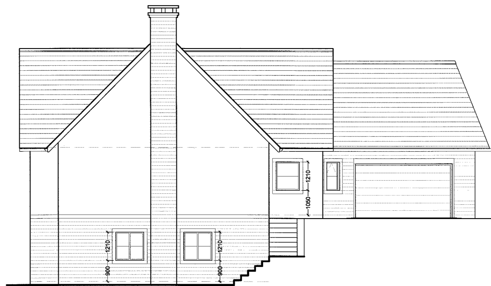
East Elevation 1:100 Scale