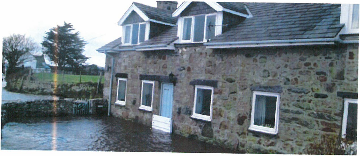
Examples of "Flood Ark" flood barrier installations.