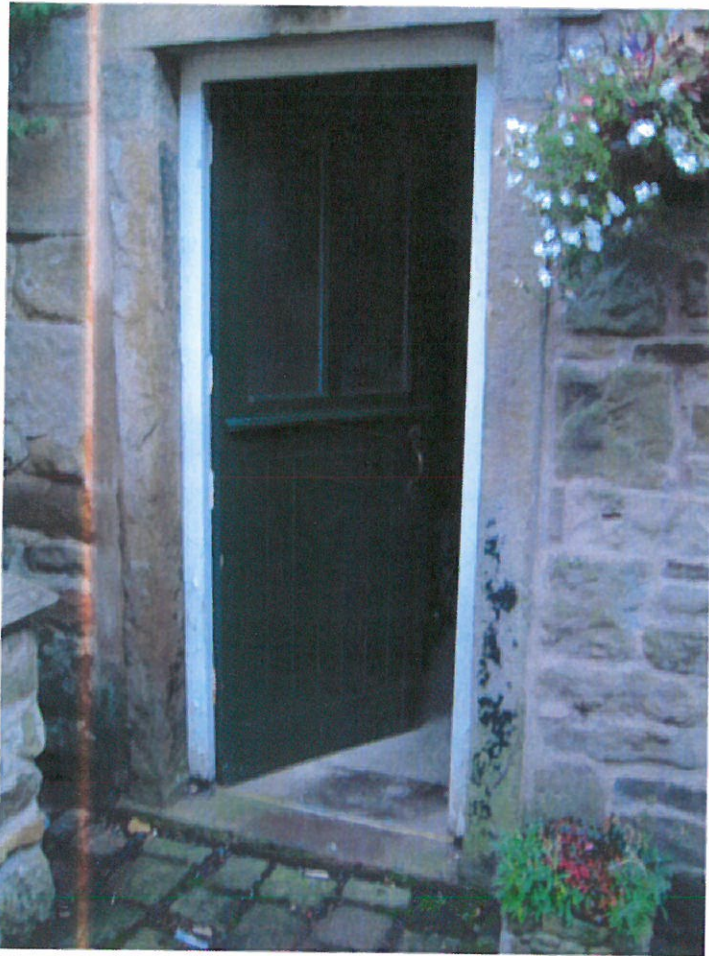
Tea Shop Store door