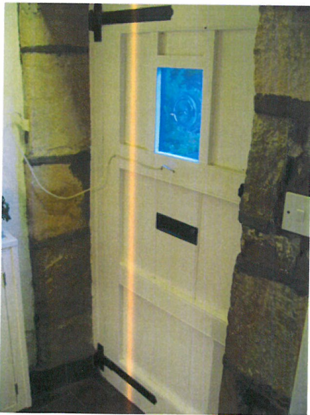
Front Door - Inside