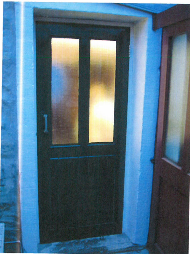
Tea Shop rear door