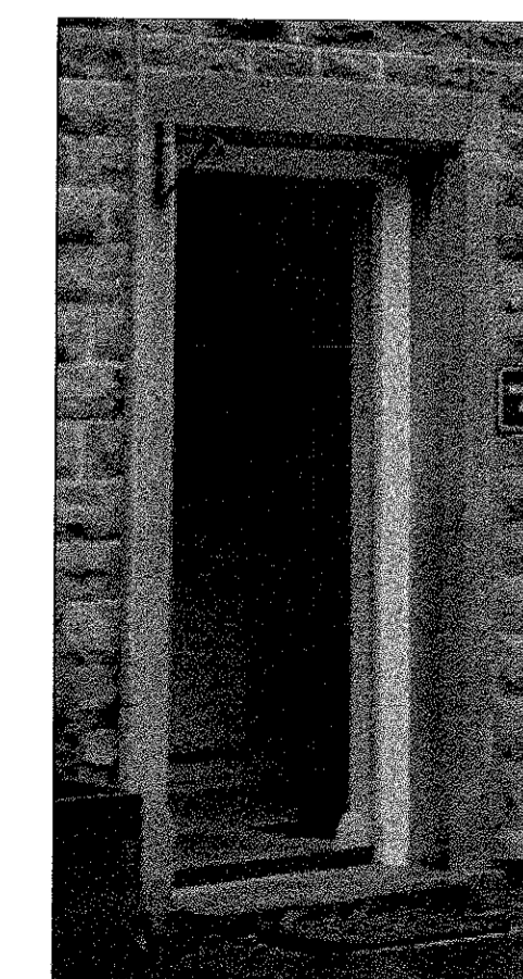
heads and cills to windows to match existing surrounds