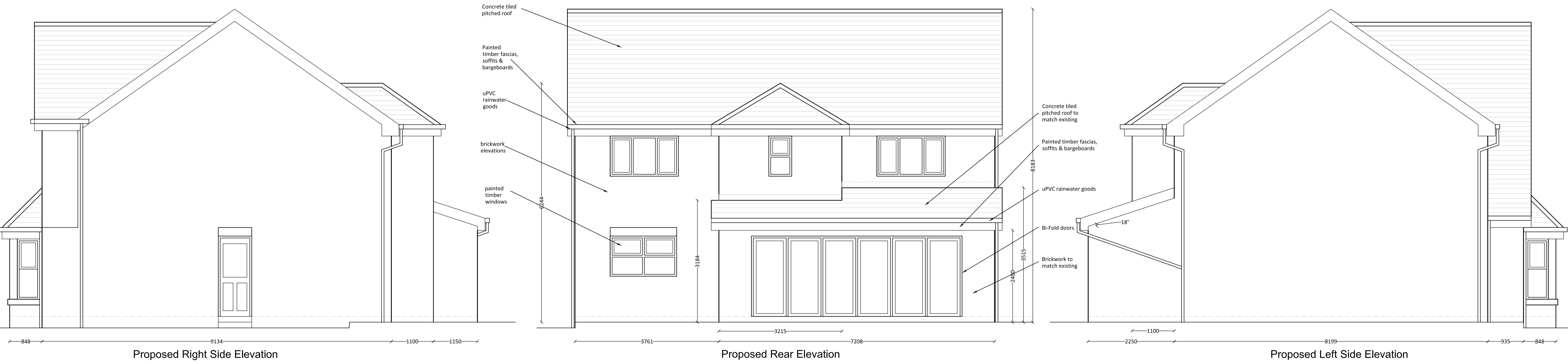
Proposed Right Side Elevation