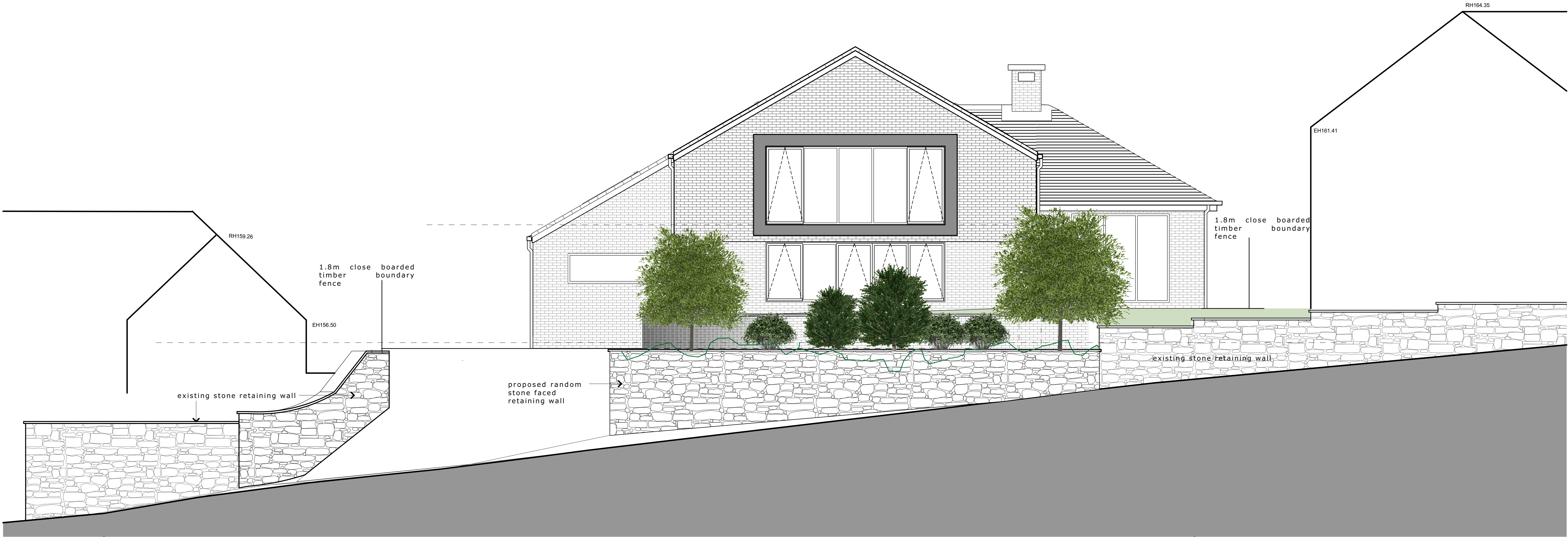
elevation to Mellor Brow 1:50

all structural retaining walls to be designed by the structural engineer