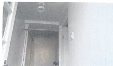
Figure 3: internal view