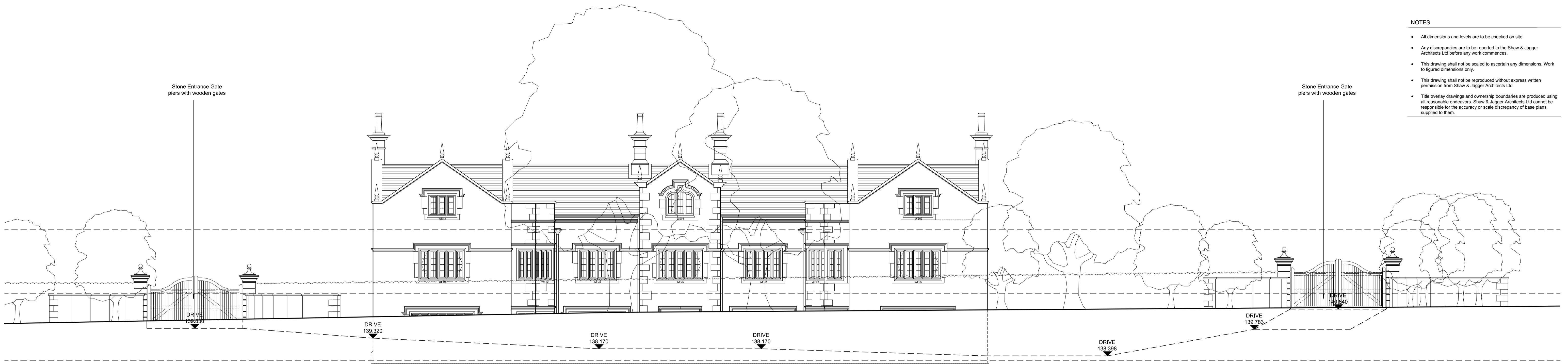
EAST ELEVATION (FROM ROAD SHOWING LAND AND DRIVE HEIGHTS)