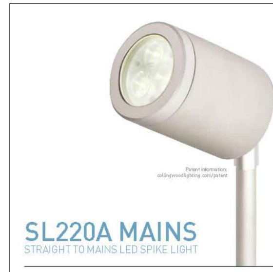
Collingwood Lighting Spike Light 3W (Directional light with adjustable angle)