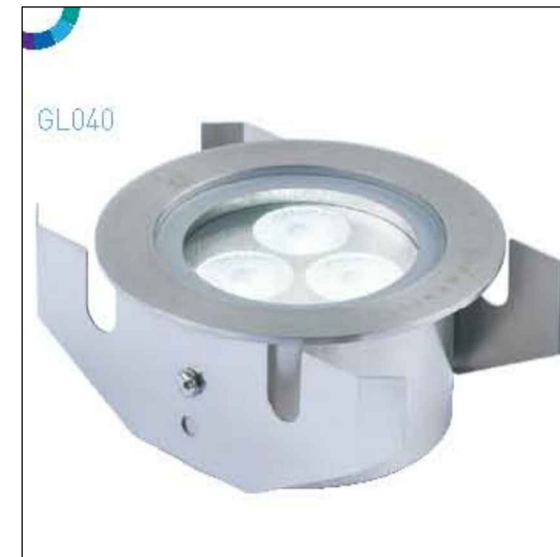
Uplighter Type 1 - Collingwood Lighting 3W uplighter