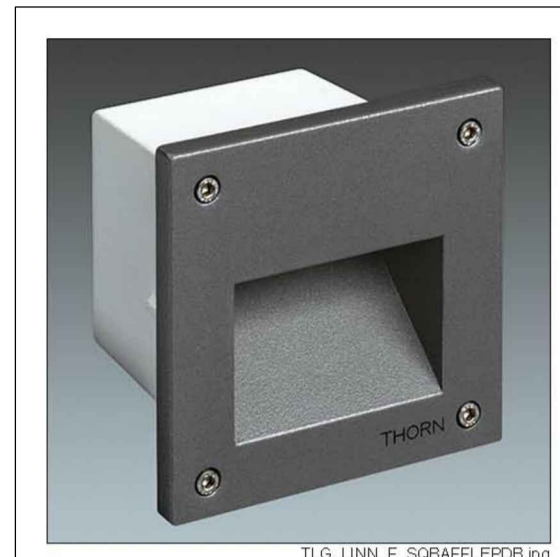
Thorn LINN Square Recess Box