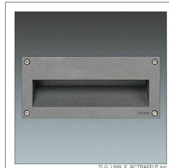
Thorn LINN Rectangular Recess Box