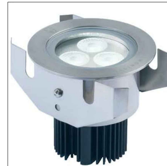
Uplighter Type 2 - Collingwood Lighting 7W uplighter