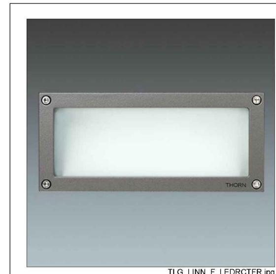
Thorn LINN Rectangular Light (sits within recess box)