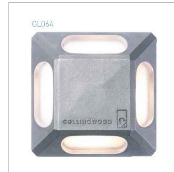
Uplighter Type 3 - Collingwood Lighting 5W marker light