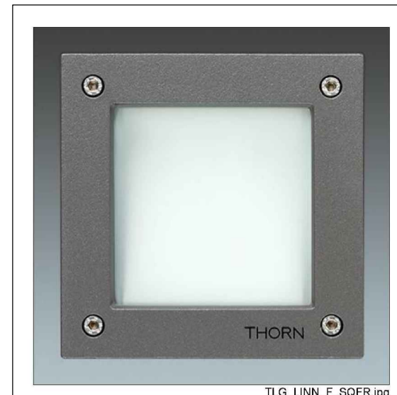
Thorn LINN Square Light (sits within recess box)