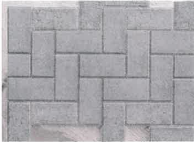
Pl. 3 Marshalls (or similar) charcoal standard concrete block paving to be used for finishing the private driveways on each plot