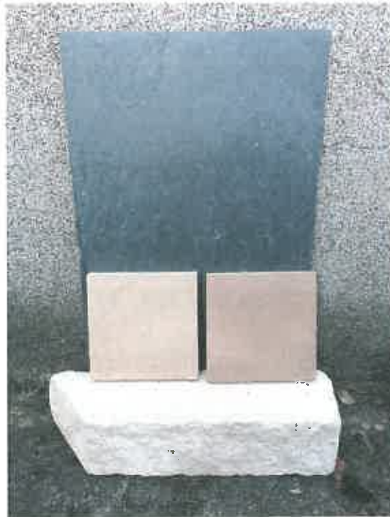
Pl. 1 Photograph showing buff textured natural stone for all external walls which would be laid to random coursed varying from 65, 90, 115 and 140mm courses (no quoins), below samples of dressed natural buff stone for all window / door surrounds, string coursing and chimney cap detailing. It also shows how this would appear next to the proposed natural blue slate (Spanish) for all pitched roofs (shown behind the stone).