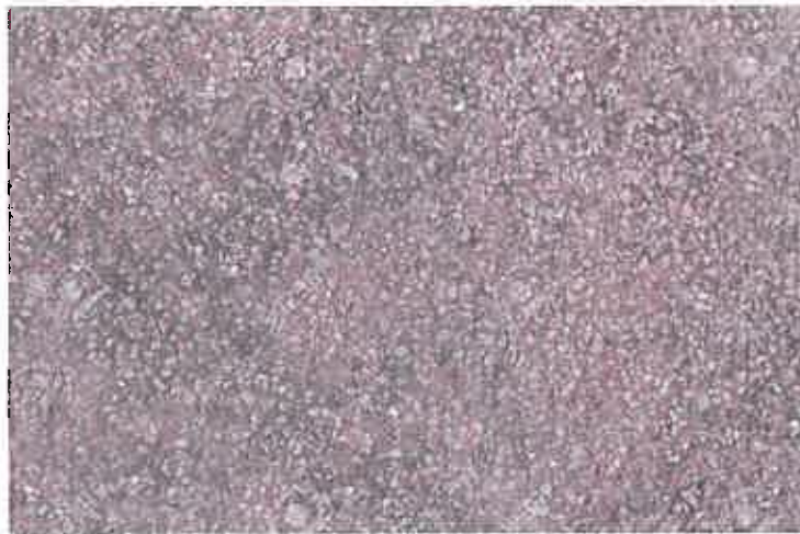
Pl. 4 Red rolled macadam to be used to finish the Access Way

Actual samples are available on request.