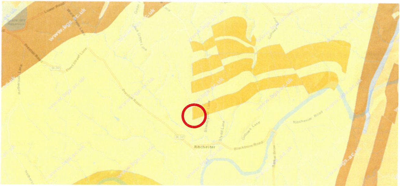
PL01: Extract of a British Geological Survey Map showing the location of the application site.