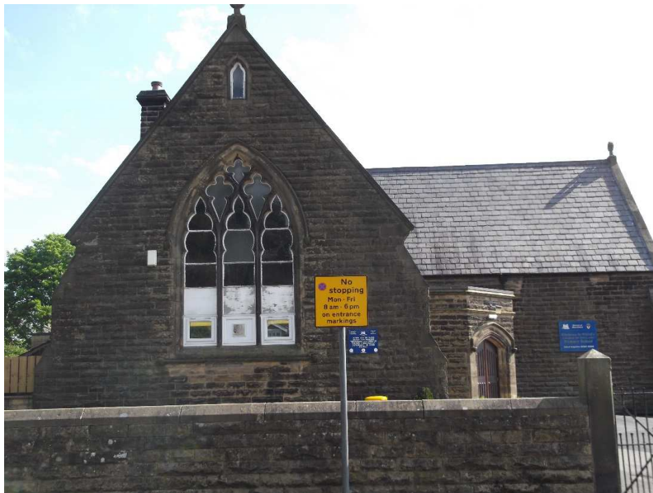
Figure 4 (South West Elevation) facing on to Church Street