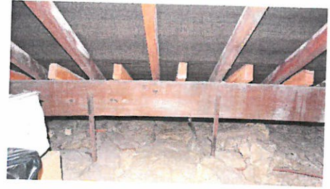
Figure 6: eaves void (front)