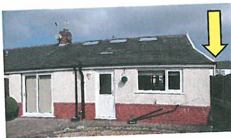
Figure 2: rear elevation