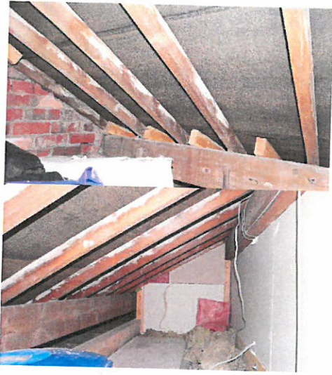
Figure 4: eaves void (rear)