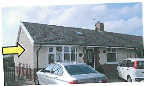
Figure 1: front elevation

Externally the building is well-maintained; all windows and doors are double-glazed. External walls are rendered and pebble-dashed above the brickwork plinths. Roof areas including ceramic ridge tiles, roof verges, lead work flashings and pvc fascia-soffits are very well-sealed and fully secure (figures 1 to 3).