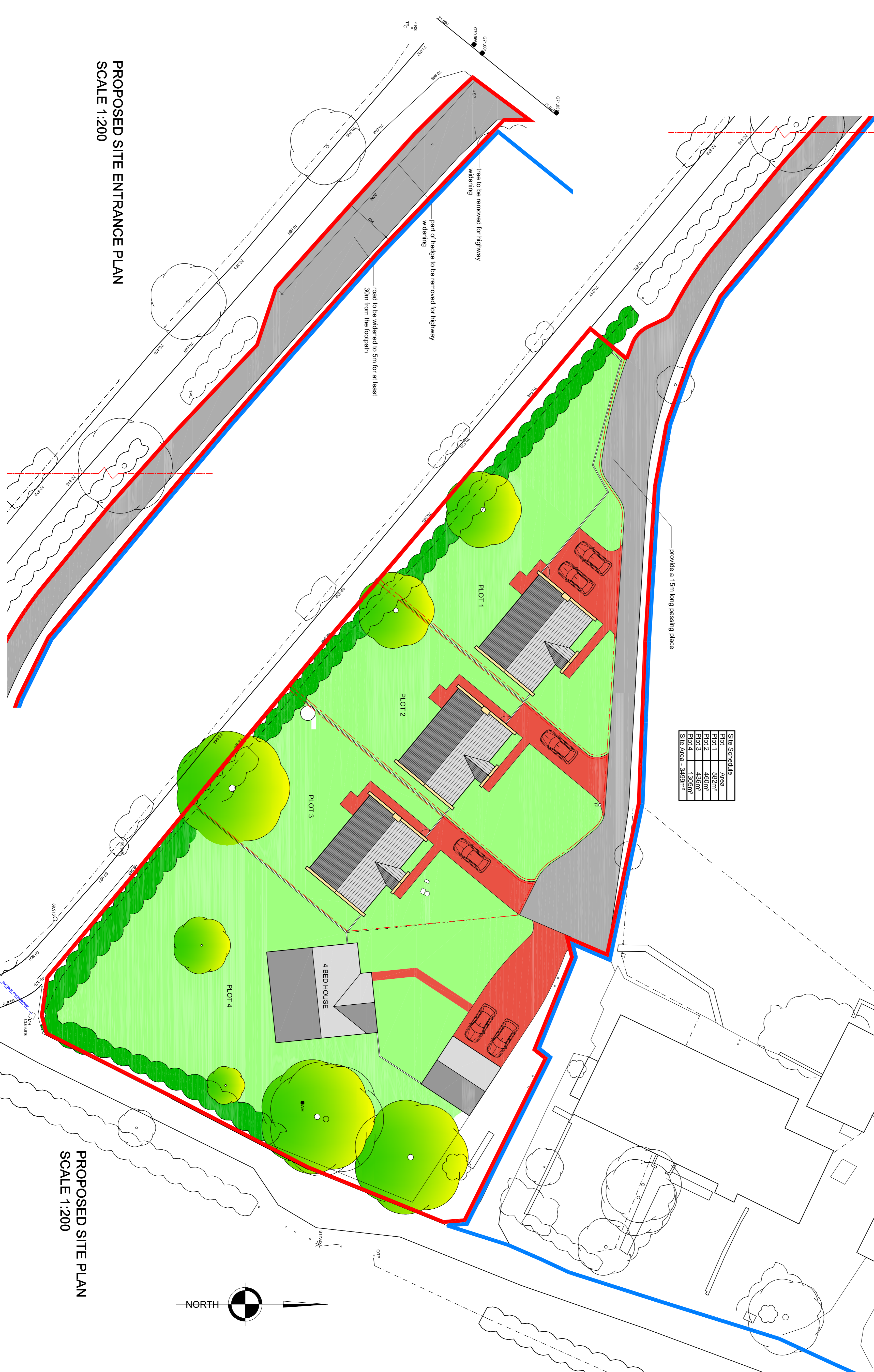
PROPOSED SITE ENTRANCE PLAN SCALE 1:200