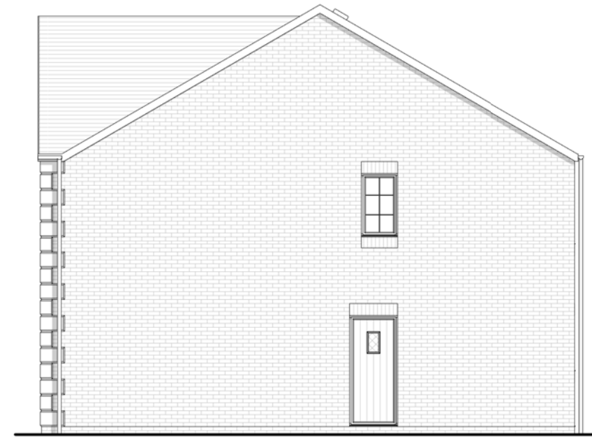
Right Elevation 1 : 100