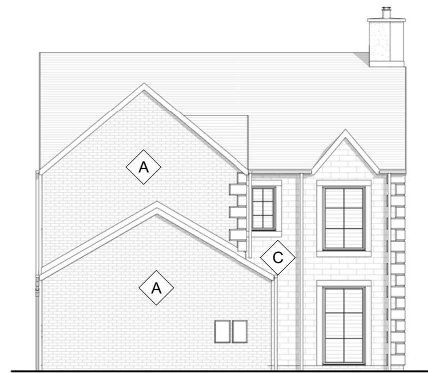
Left Elevation 1 : 100