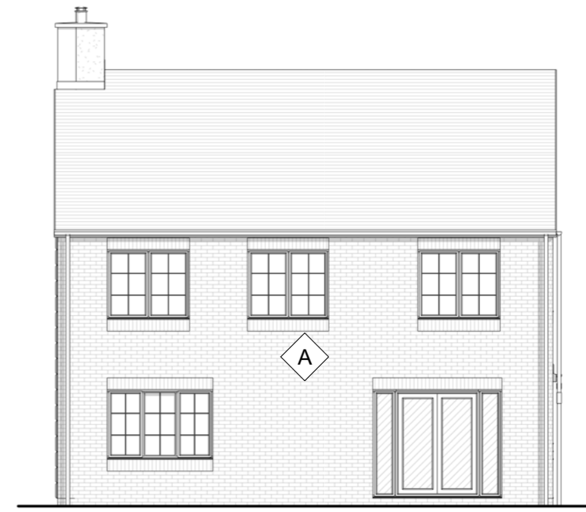
Right Elevation 1 : 100