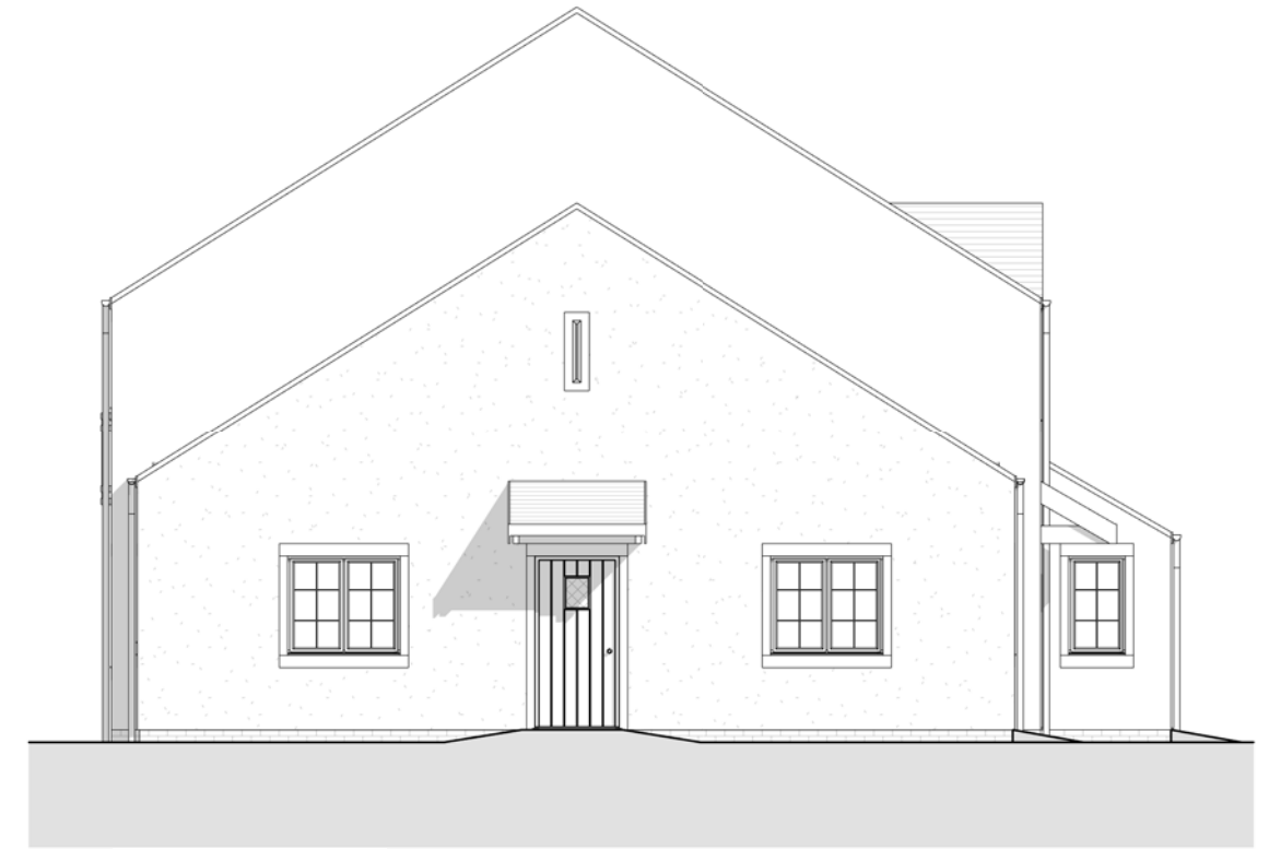
Left Elevation 1 : 100