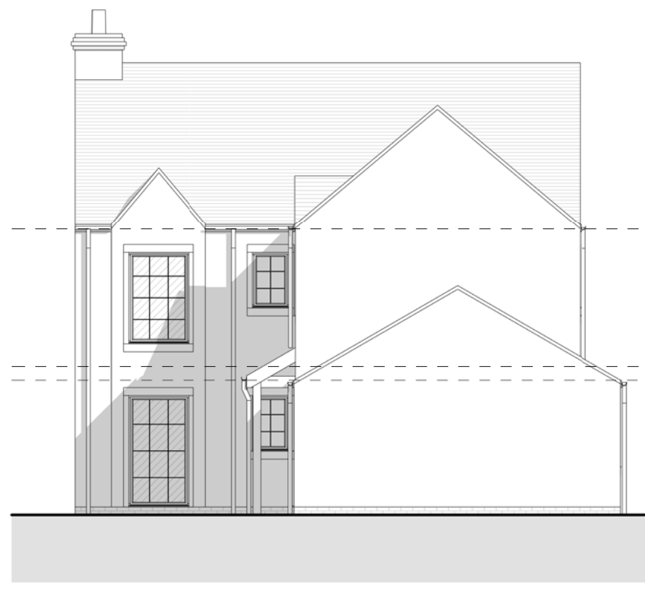
Right Elevation 1 : 100