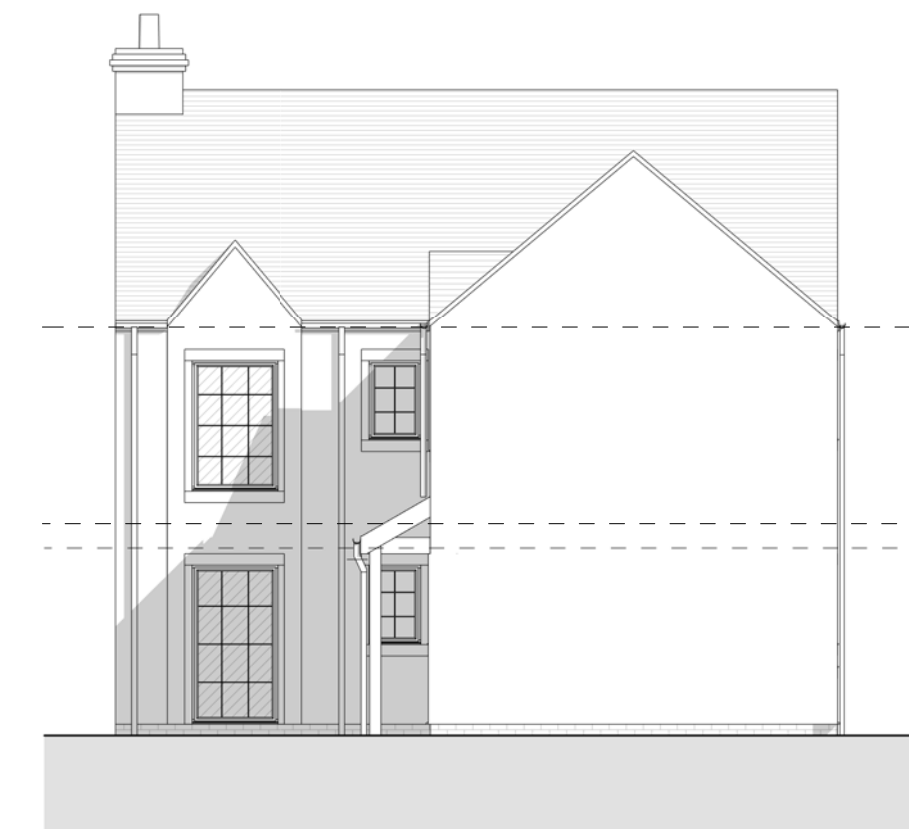
Right Elevation 1 : 100