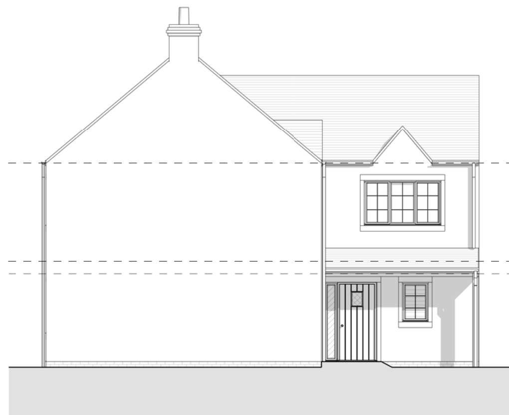
Front Elevation 1 : 100