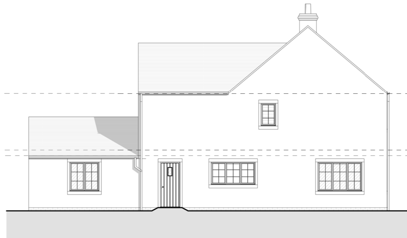
Rear Elevation 1 : 100