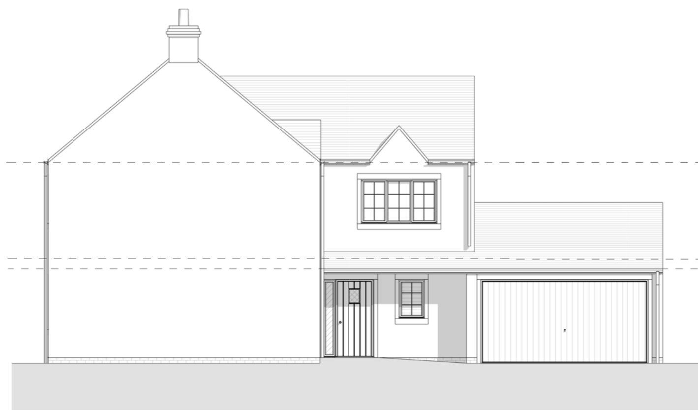
Front Elevation 1 : 100