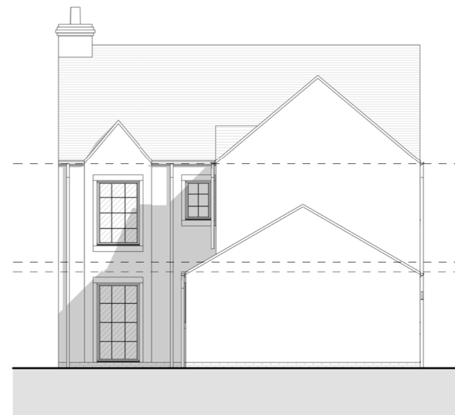
Right Elevation 1 : 100