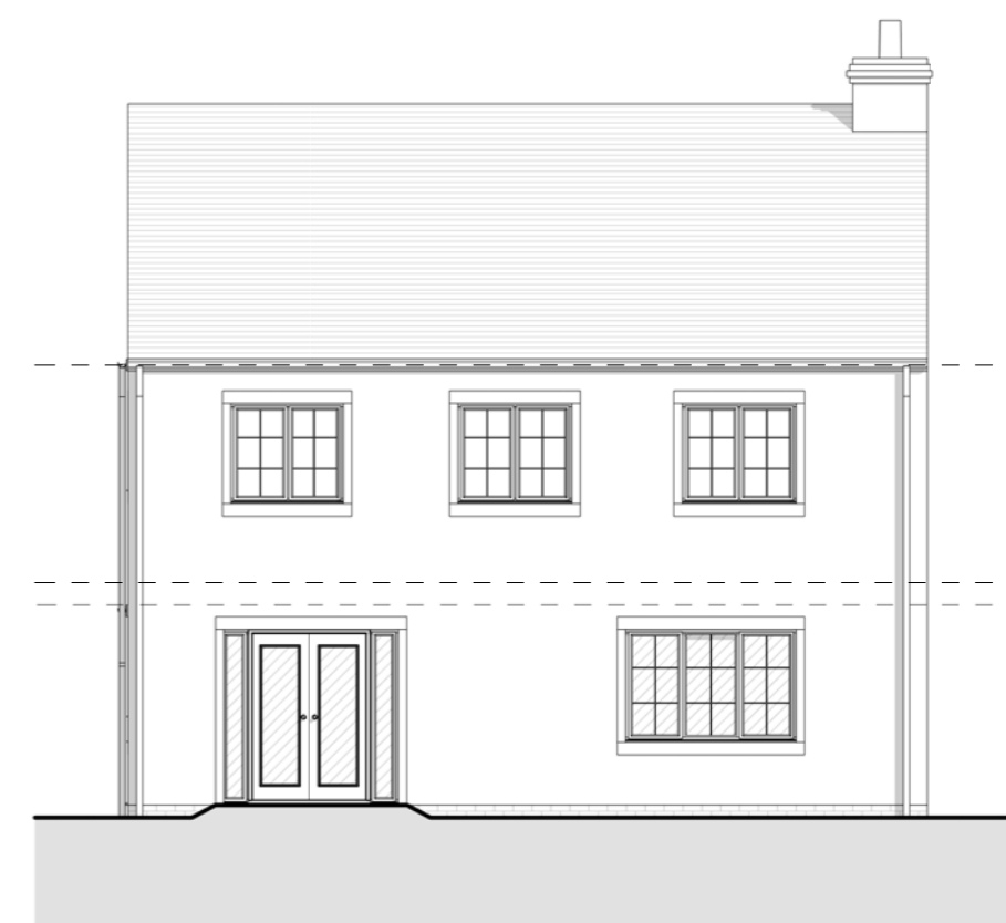
Left Elevation 1 : 100