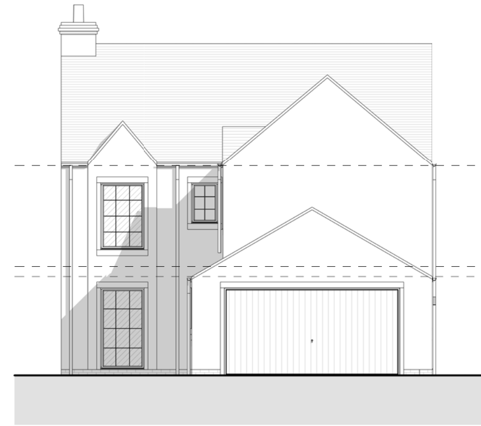
Right Elevation 1 : 100