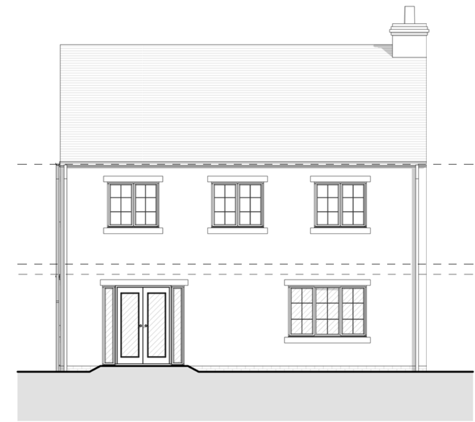
Left Elevation 1 : 100