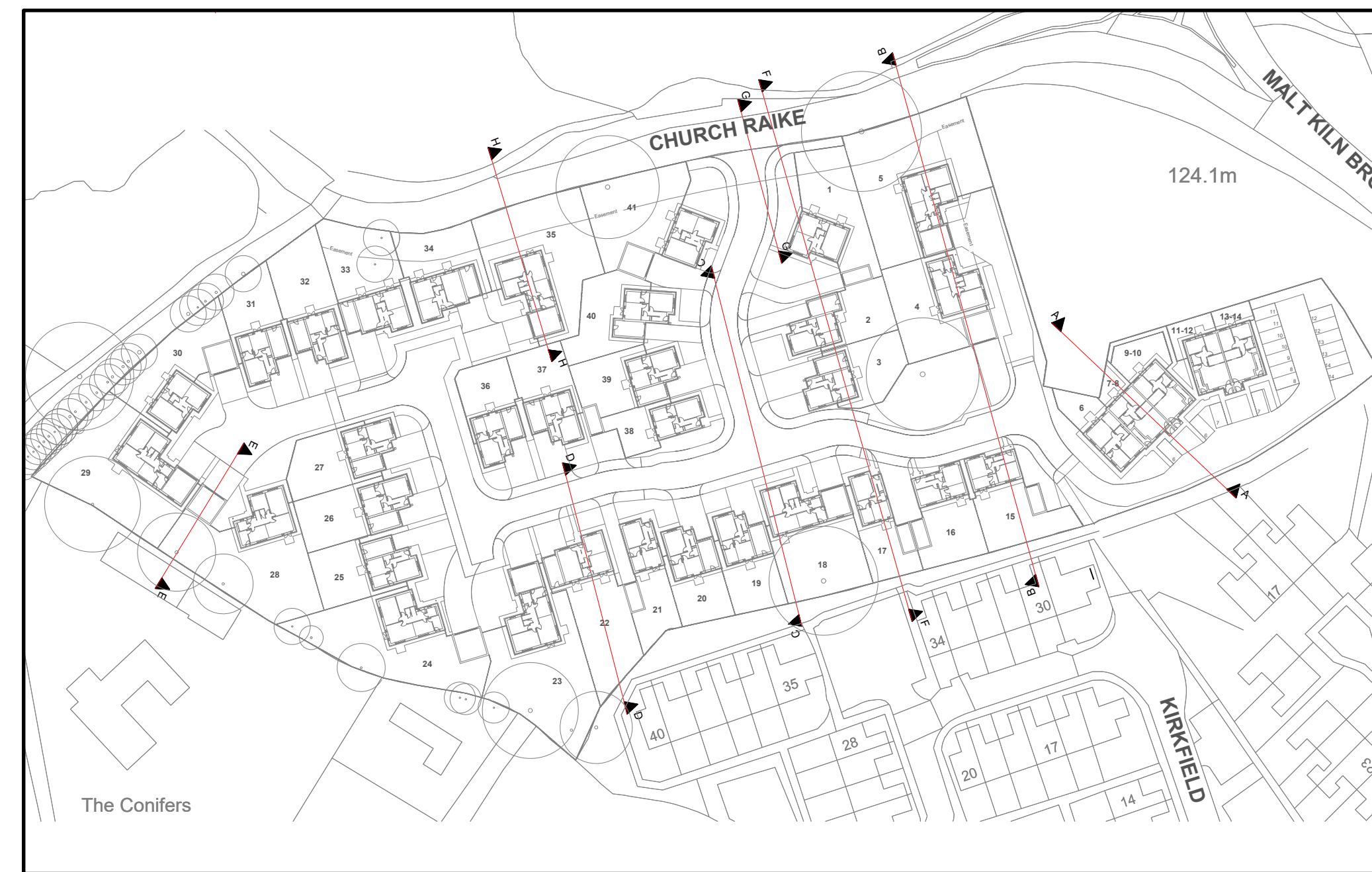
SITE PLAN SCALE 1:1000