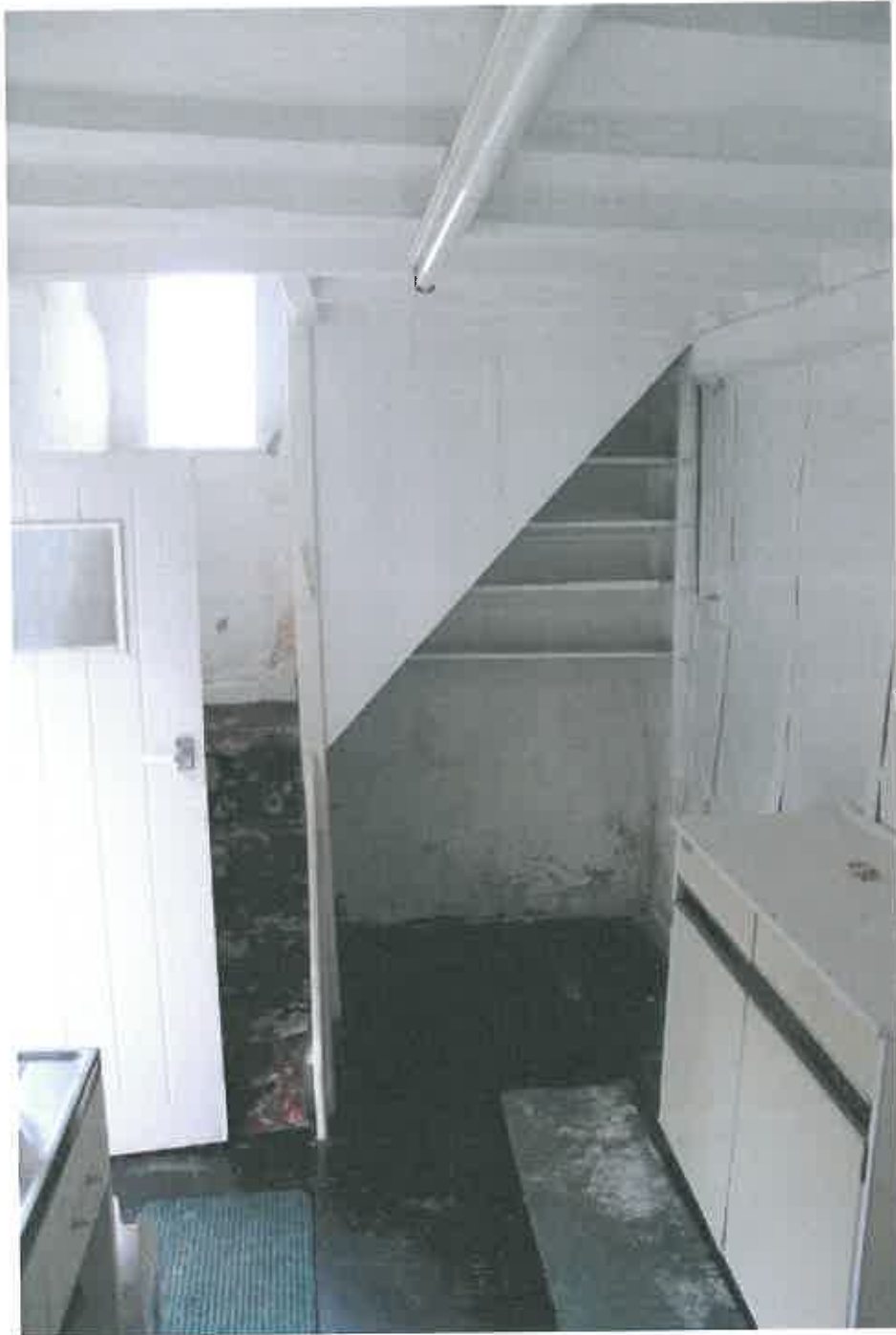
Rear room (scullery) to No 13