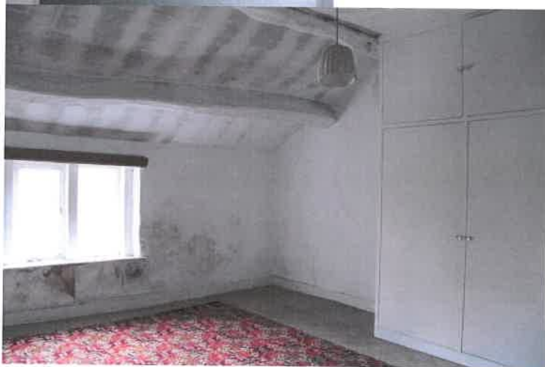
The 2 existing first floor rooms in No 13