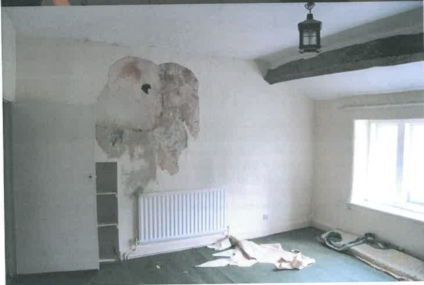
The 2 existing first floor rooms in No 11