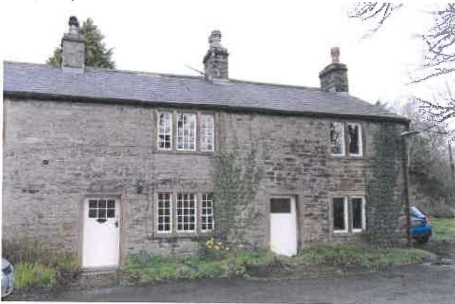
Front of properties, No 11 on the Left.

The drawings submitted with the planning application refer. So in overview we would like to obtain permission to make the following changes to the property.