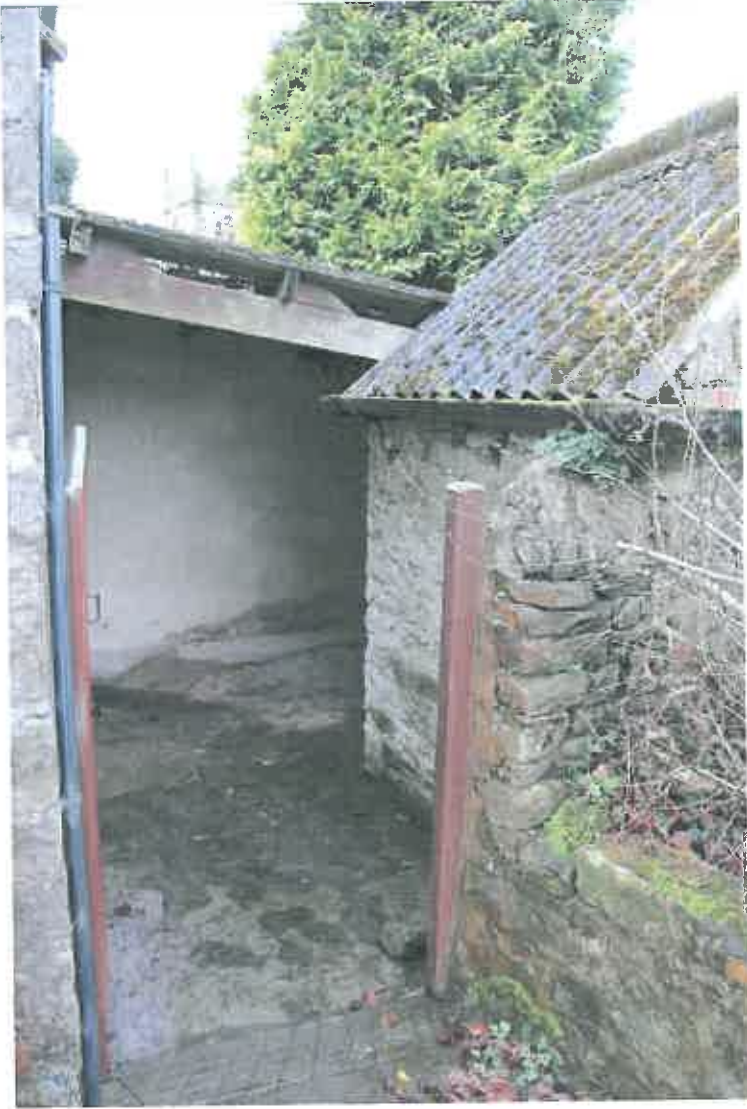
View through the red gate into the covered area at the rear of No13.