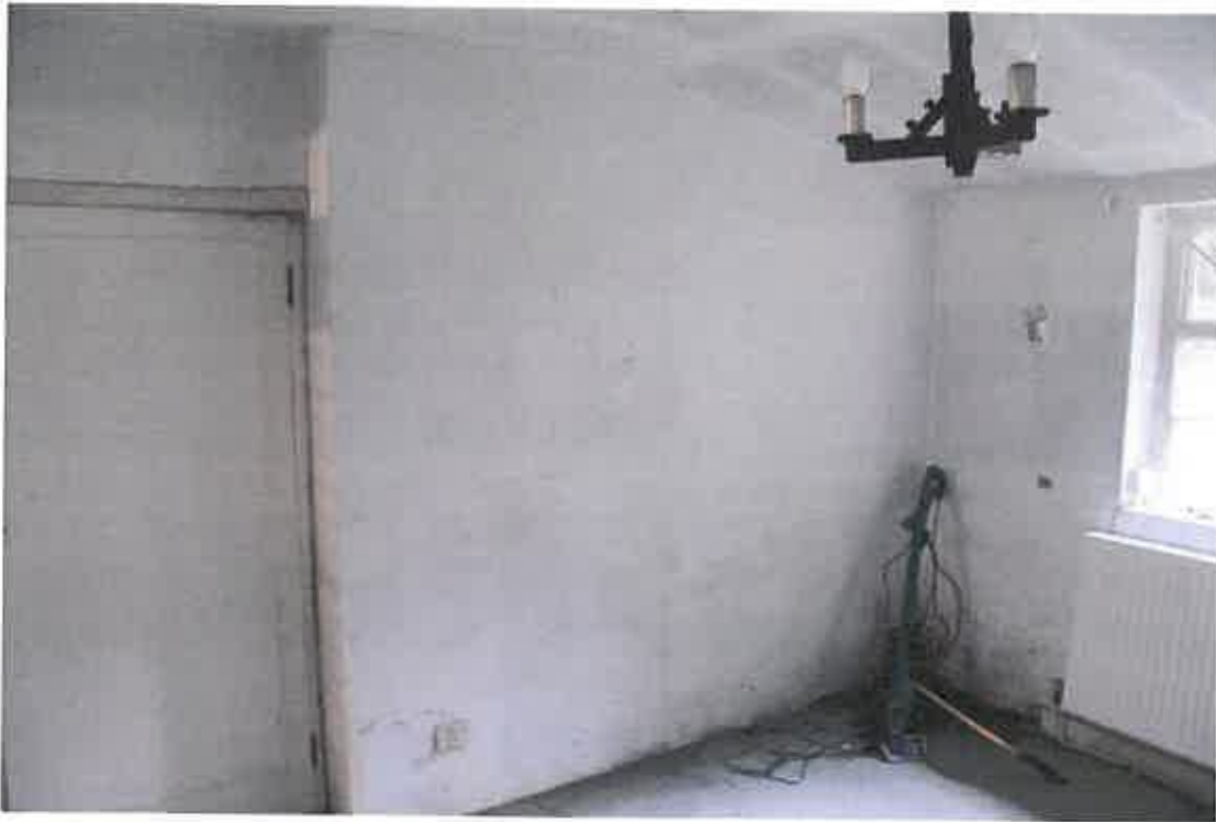
Extension to rear of No 11 Internal.

This is the small extension to rear of No 11. We do not believe that looking at the buildings listing description that this extension was an original part of the property, but has been added at some time since.