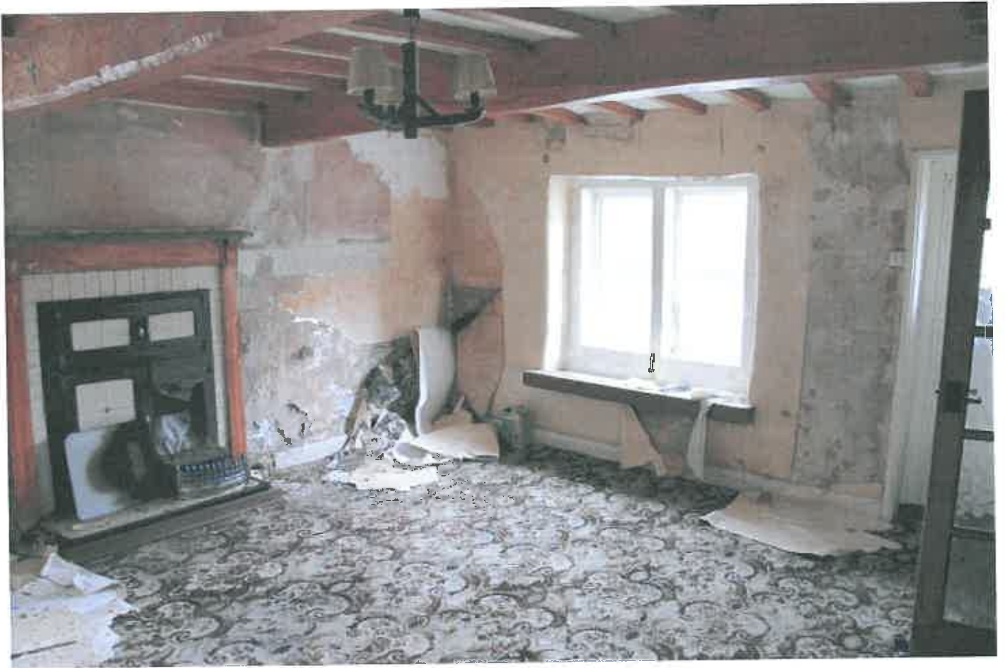
Front ground floor No 13 with Range/fire, window and beams to be retained