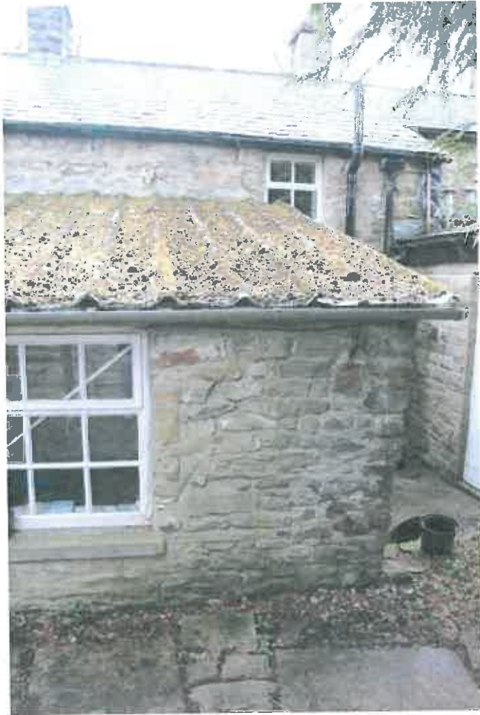
Extension to rear of No 11 external from footpath

This is the existing extension which is for proposed demolition and replacement. The wall to the far right is the extension on number 9 (adjoining property)