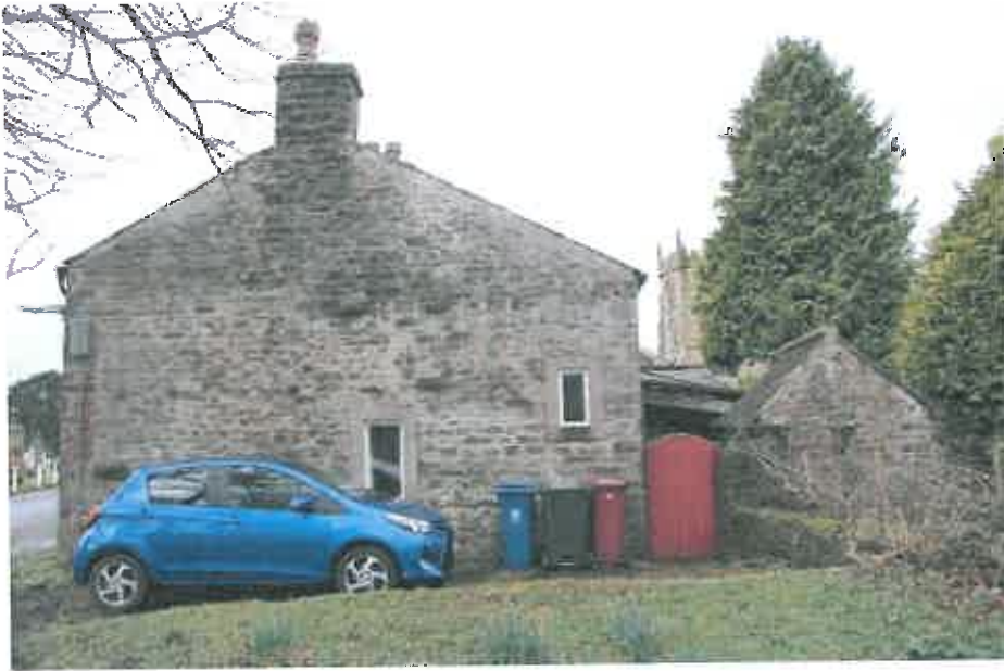
Gable end of No 13.

may be required on the roof, but this will be at worst the replacement of any broken slates, again with the same slate as exists. Normal decoration of windows and doors is proposed.