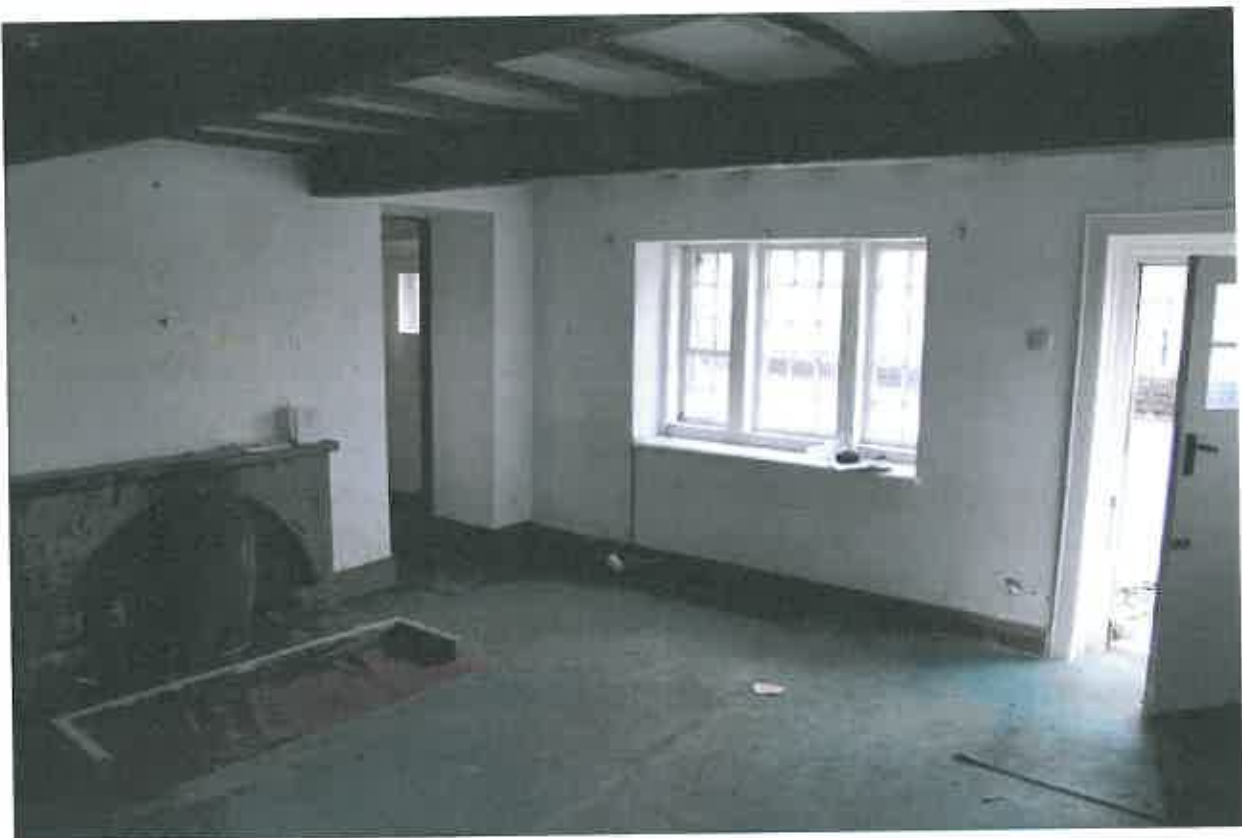
Front ground floor room No 11 fireplace to be removed, window and beams to be retained.