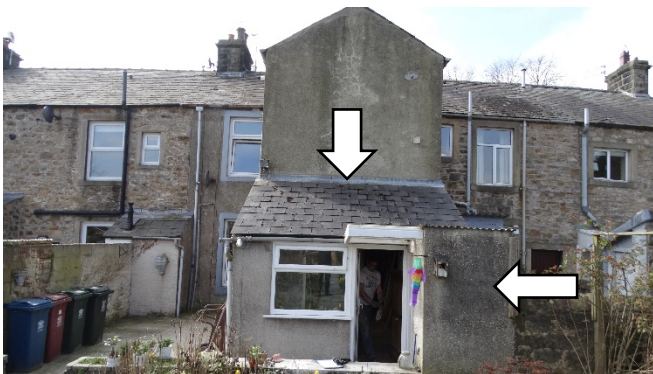
Figure 1: rear elevation (north-east)

An adjacent (and separate) WC has a similar construction with a corrugated cement fibre mono-pitch roof.