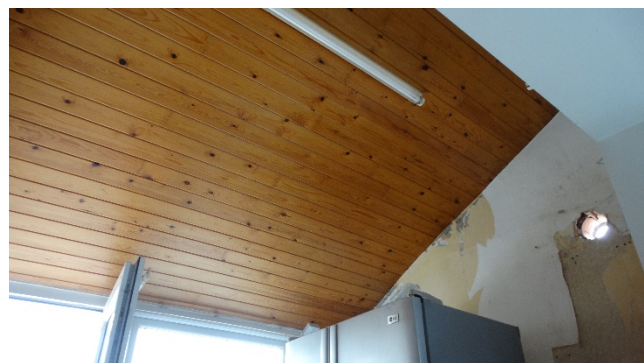
Figure 4: internal view of roof