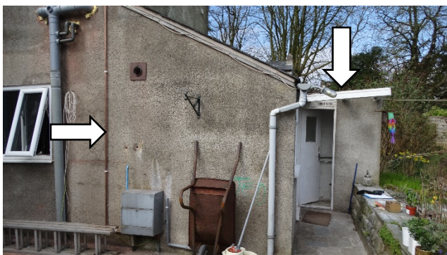
Figure 3: SE elevation