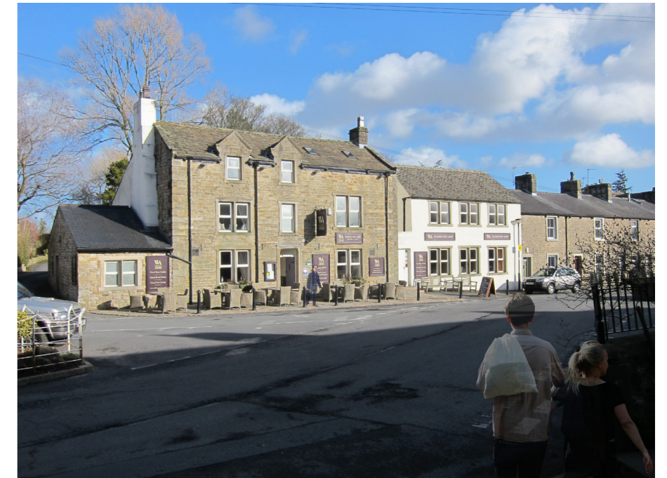
Development option - submitted at pre-app stage

The existing property is a large, three-storey building of stone construction, with single storey extensions to the side and rear. The brief from the client was to provide improved kitchen facilities and additional bedrooms to meet the demand of this popular destination.