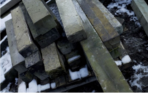
Natural stone head, cills and jambs. Sourced from local stone yard.

Door & windows to be brown UPVC frames with double glazing