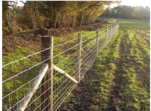
1 metre high timber post and rail stock fence, to perimeter of site (100mm square Galv. Round wire guarding fixed to timber supports).

Supplied by: Hartlington Fencing Supplies Hartlington Skipton North Yorkshire BD23 6BY Tel:01756 720318