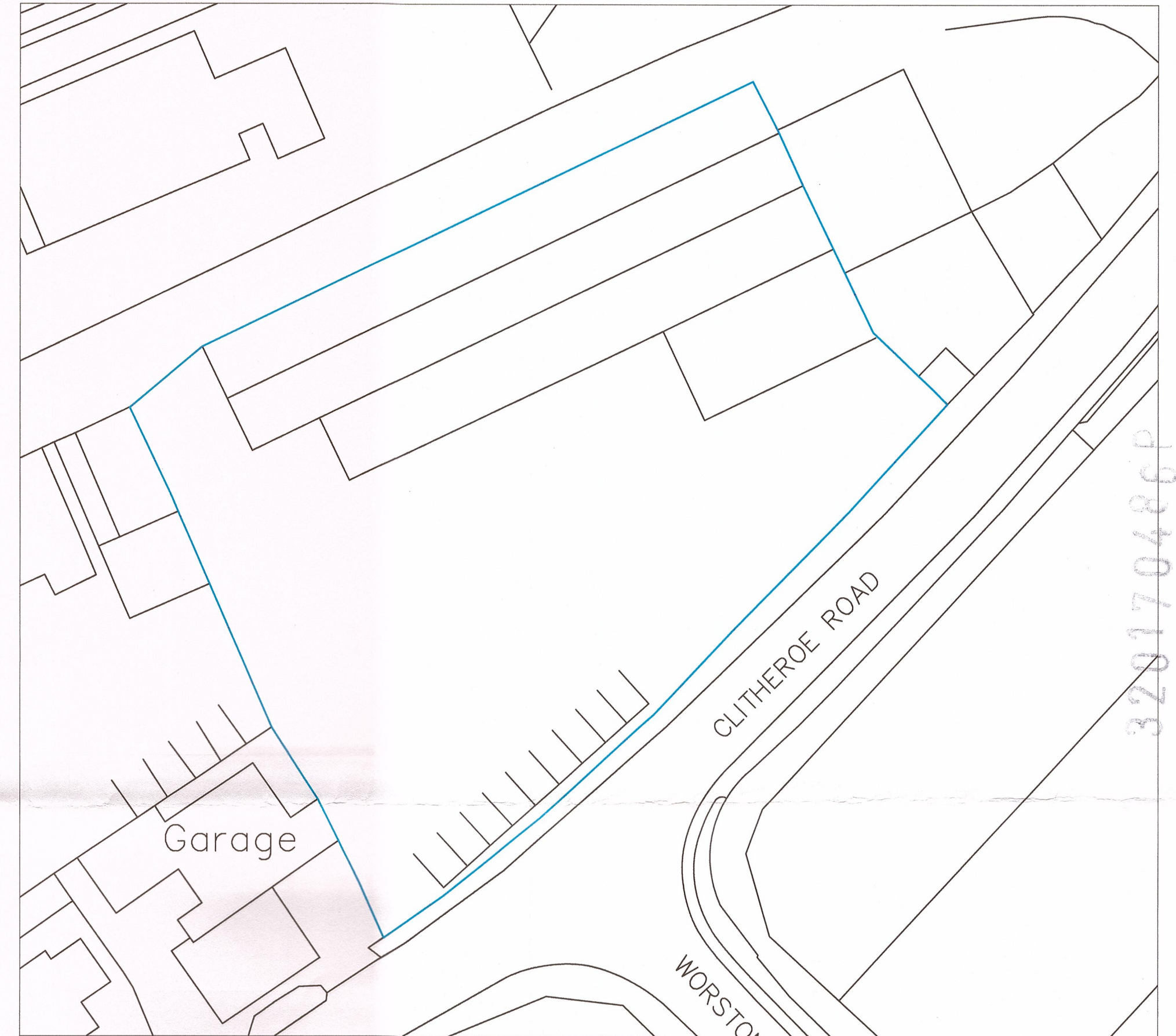
Proposed Site Plan - 1:500